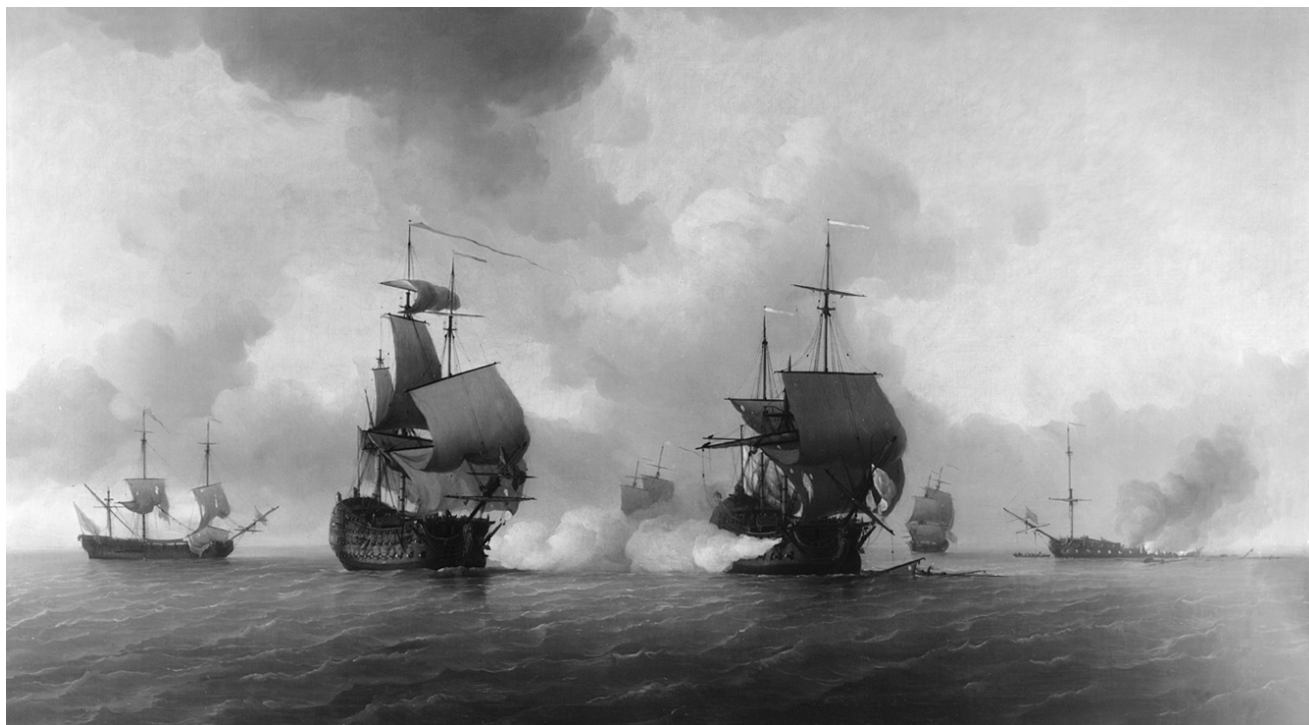
Figure 2: Capture of the Glorioso 1747, courtesy of the National Maritime Museum. Painting by Charles Brooking. (BHC0371)

Walker went on to other distinguished actions including a courageous battle with the huge 70 gun Spanish battleship Glorioso . (Figure 2). This particular battle was favorably reported in