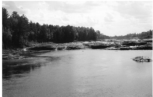
Figure 8: Head of tide on Nepisiguit River.