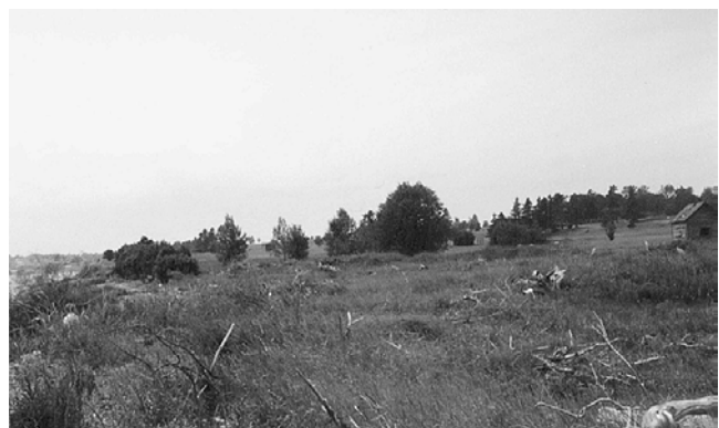
Figure 7 : Ferguson Point at the mouth of Tetagouche River

A second archaeological resource that could offer details concerning Walker's time at Nepisiguit, is the site of his winter home. Cooney states, at Youghall near the head of the harbor he had another large dwelling house which he occupied in winter. 71 On Allan's Point/Point au Pere, at the mouth of the Tetagouche River, on the same circa 1770 map that marks the Alston Point establishment, one additional structure is illustrated. The building appears somewhat removed from the lowland portion of Allan's Point/Point au Pere overlooking the wide mouth of the Tetagouche River (Figure 3). Doubtless surrounding the harbor at the time were other structures belonging to the Mi'kmaq and Acadians, however, none are marked. It would appear that this map marks only the British presence and we know from the written record that circa 1770 Walker and his crew are the only planted British at Nepisiguit.