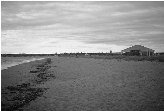
Figure 5: Chaleur Bay side of wide sand beach at Alston Point, excellent for 18th C fish drying stages (June 1996)