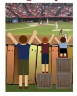
Equity= Fairness Access to Same Opportunities We must first ensure equity before we can enjoy equality.