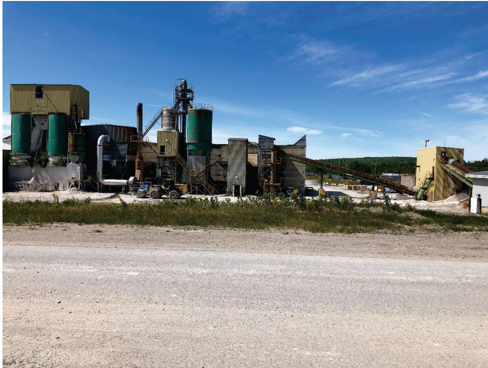
Photo 3 - View of the Site facing west (rock crusher, calcine baghouse and stucco tanks).