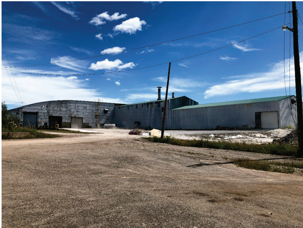
Photo 5 - View of Site facing east (outlet rolls, dryer zone #1 and north warehouse).