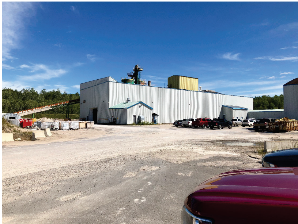
Photo 2 - View of the Site facing southeast (rock dryer and calcine tower).