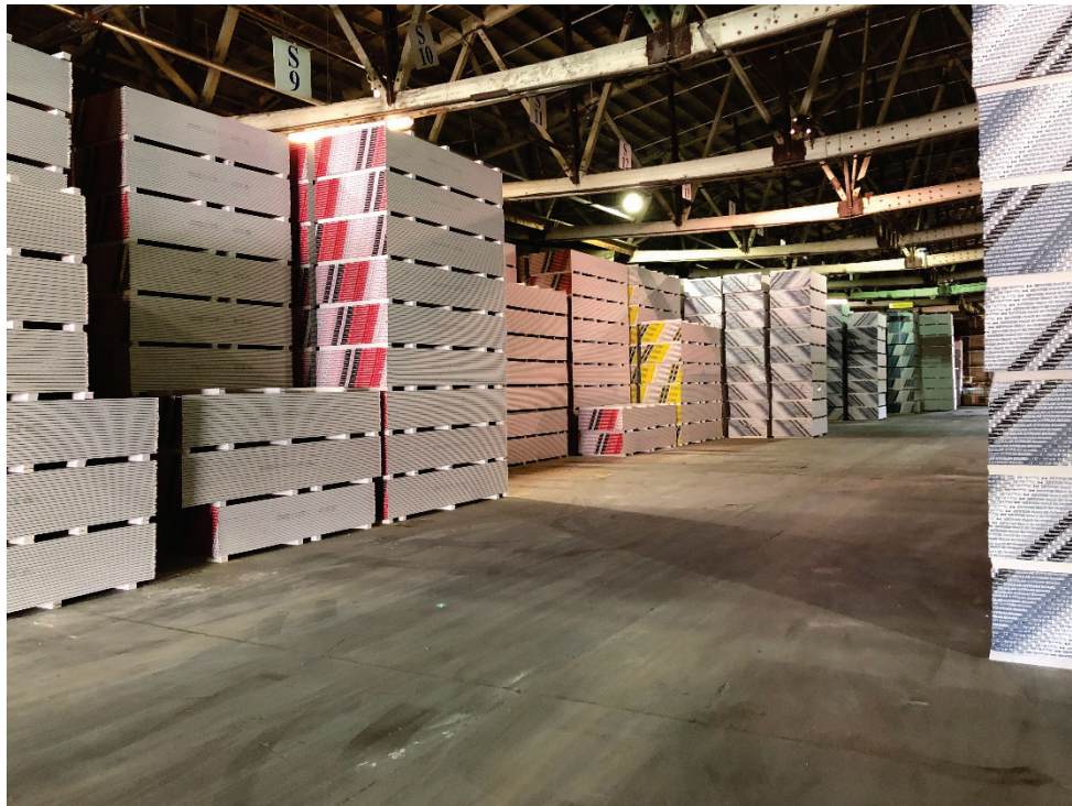
Photo 21 - View of south warehouse.