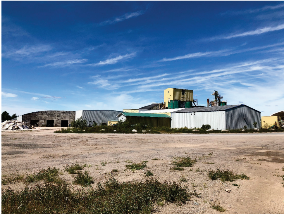
Photo 4 - View of the Site facing northwest (forklift maintenance, paper storage, paper delivery, and south warehouse).