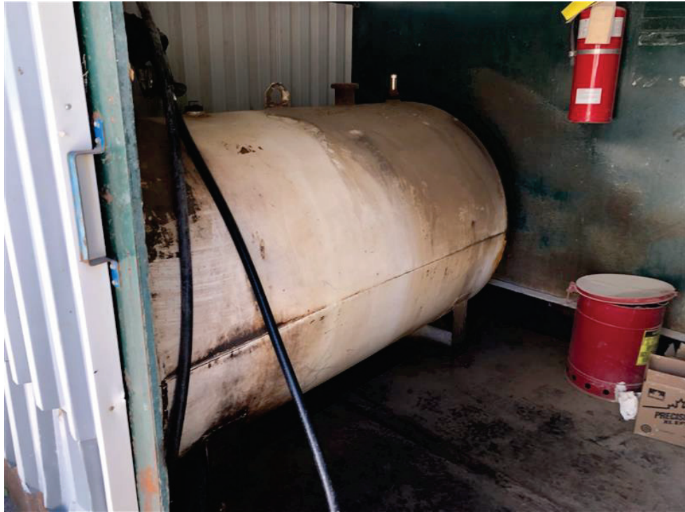
Photo 47 - View of 1,100 L diesel tank located in the Loader Shed.