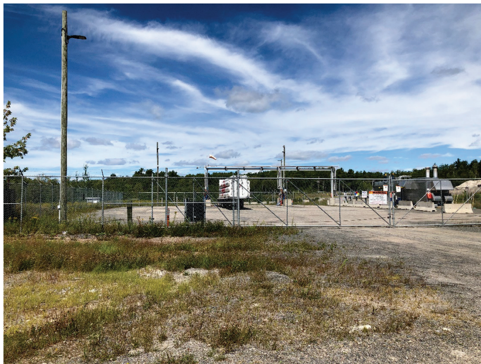
Photo 44 - View of on-site CNG terminal operated by Irving Oil, facing north.