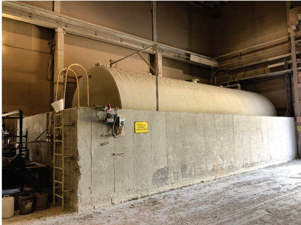
Photo 29 - View of 113,500L Furnace oil tank (formerly bunker C) in rock dryer area.