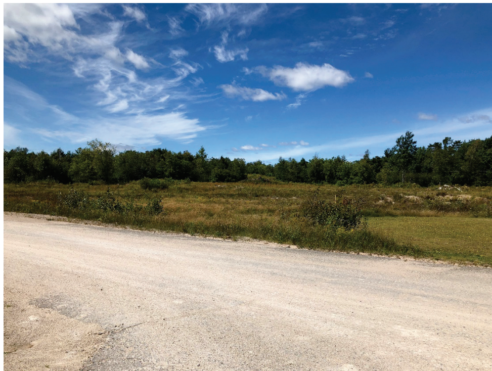
Photo 46 - View of rockhill extension area on the north portion of the property, where old building debris buried.