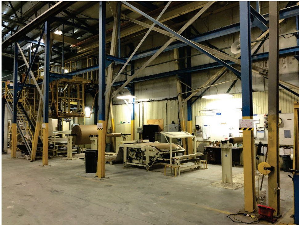
Photo 11 - Photo of unwind stand in paper staging area.