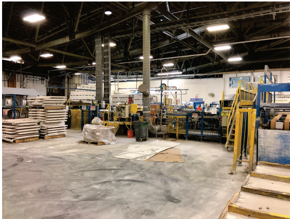
Photo 18 - View of booker, bunder and stacker area.