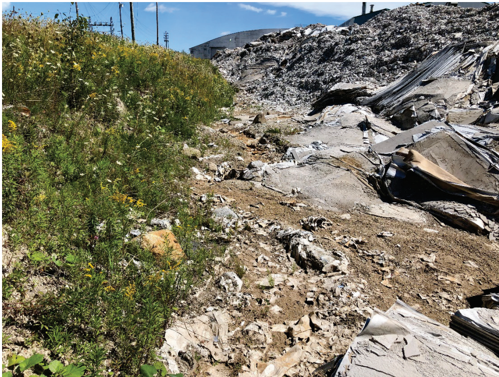
Photo 37 - View of drainage ditch along the edge of the waste wallboard pile.