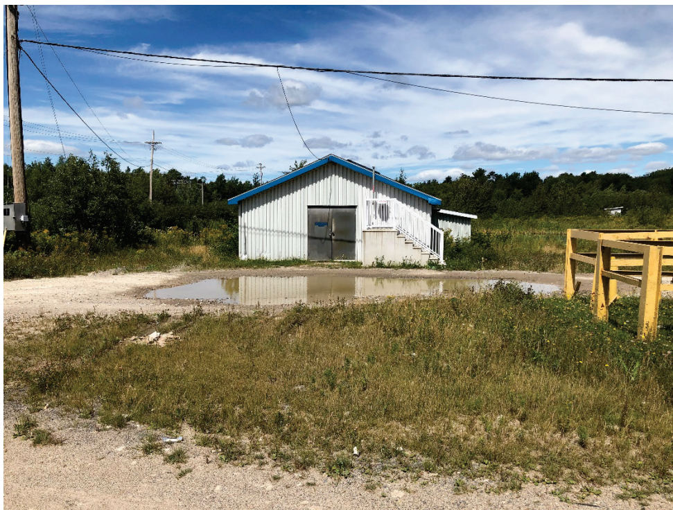
Photo 42 - View of fire pump house, looking north.