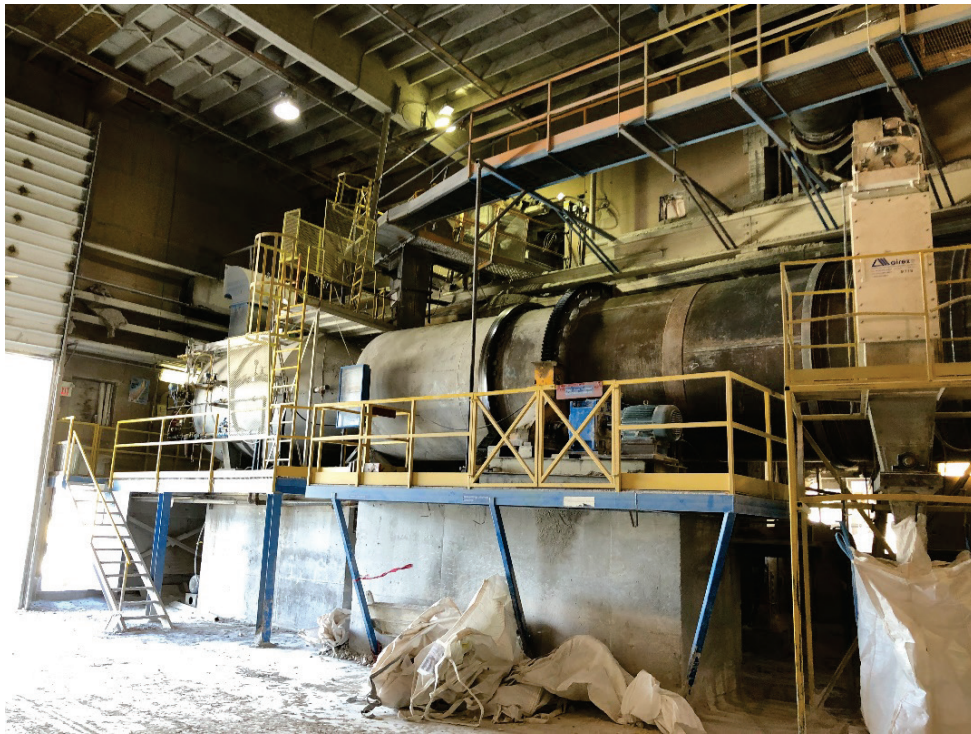
Photo 9 - Photo of rock dryer.