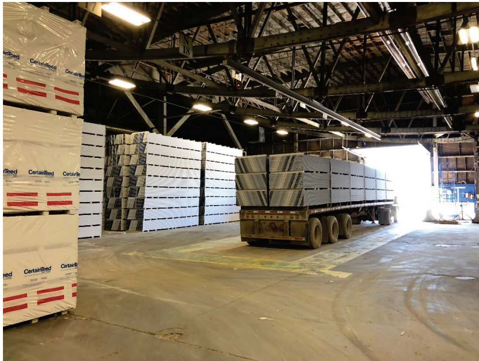
Photo 19 - View of truck loading portion of north warehouse.