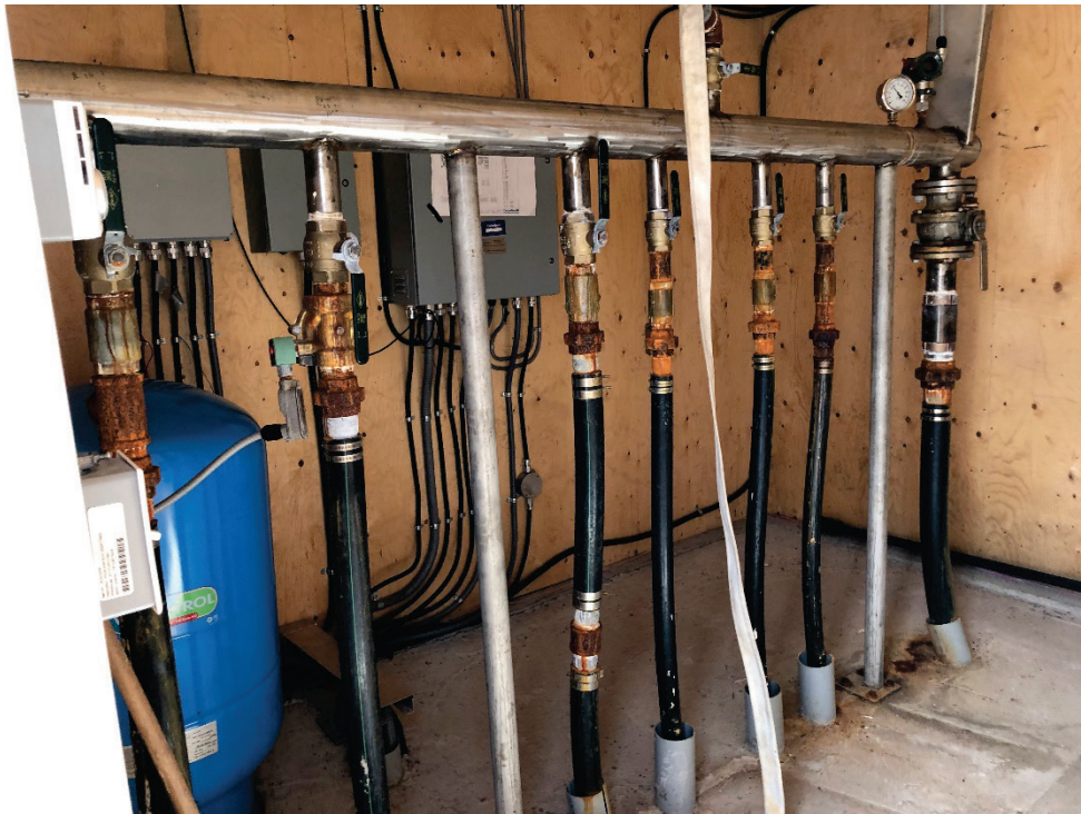
Photo 41 - View of main pump house controlling all the onsite wells.