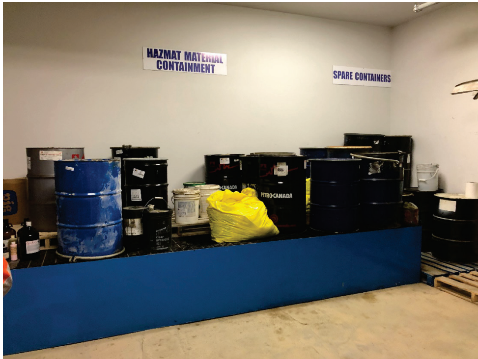
Photo 23 - View of hazmat storage room for waste chemicals and oils.