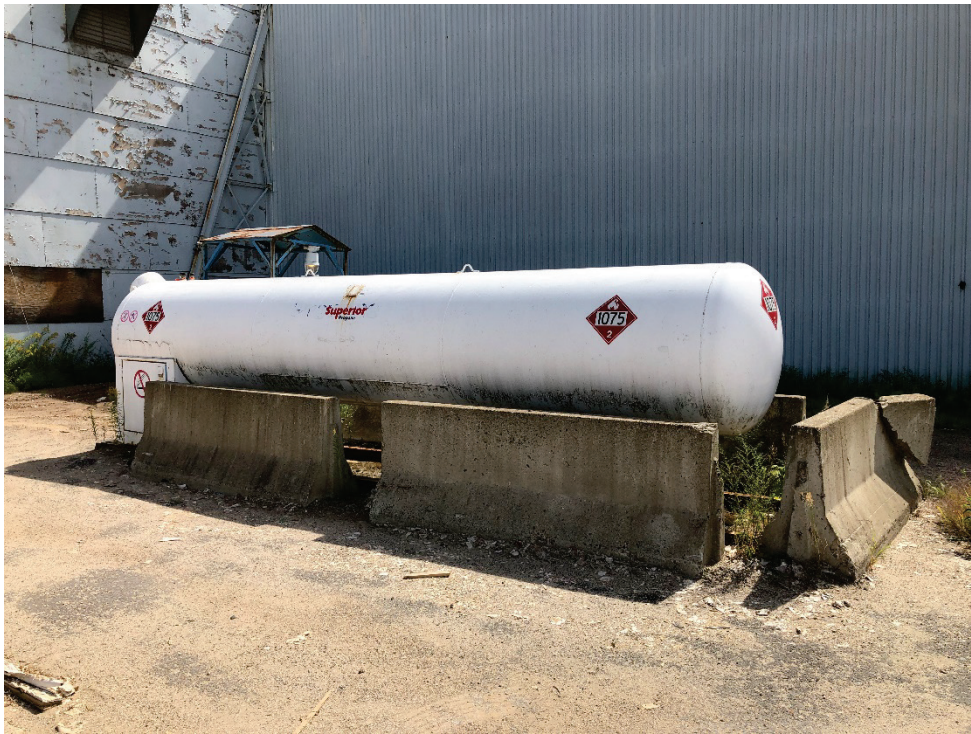
Photo 31 - View of propane storage tank located outside north warehouse to the west.