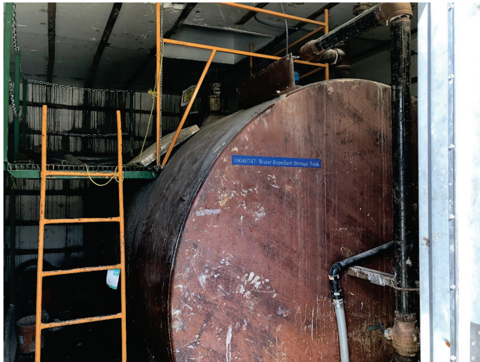
Photo 28 - View of storage tank in AQUA.