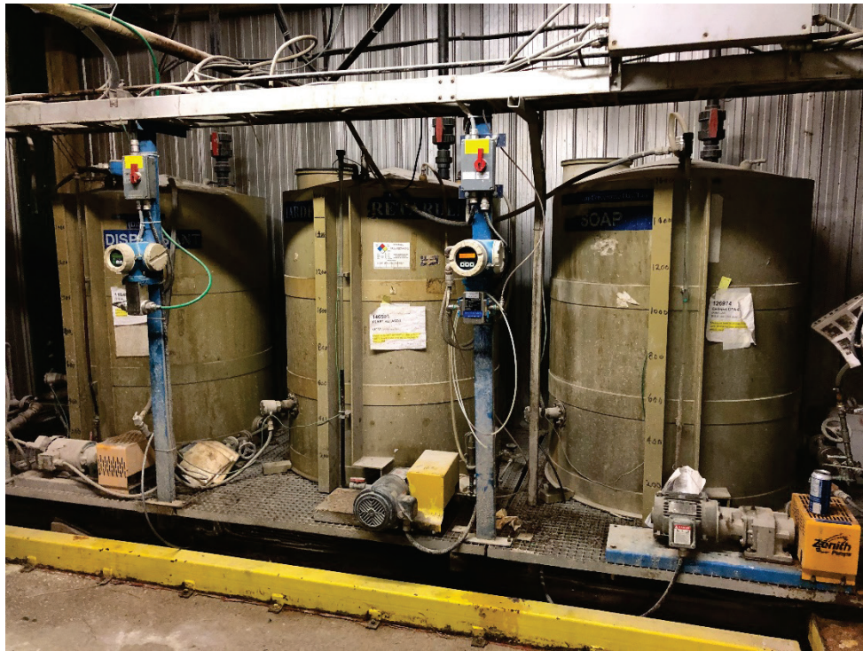
Photo 27 - View of chemical storage tanks in wet additives area.