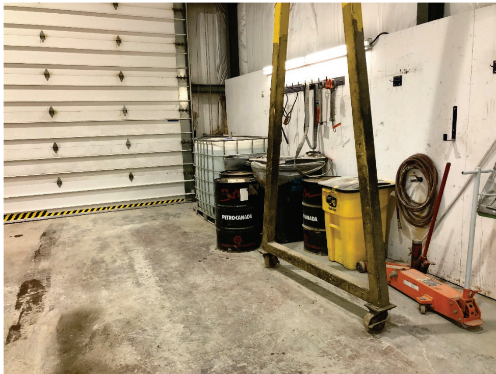
Photo 24 - View of forklift maintenance area (barrels of oils stored in corner).