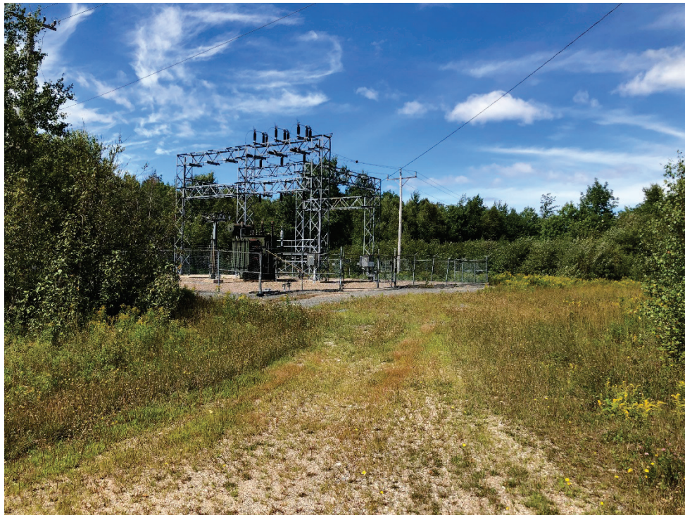
Photo 45 - View of transmission substation located on the northwest corner of the site.