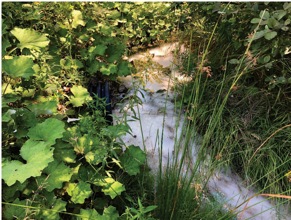
Photo 34 - View of outlet pipe from site surface drainage system, entering swale ditch on the south side of the property.