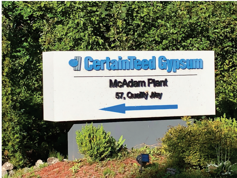
Photo 1 - View of the Site Entrance.