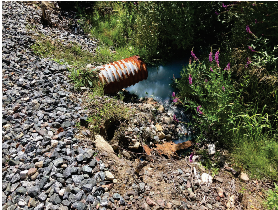
Photo 39 - View of outflow culvert across the main line tracks leading off-site entering designated wetland and the Digdequash water system.