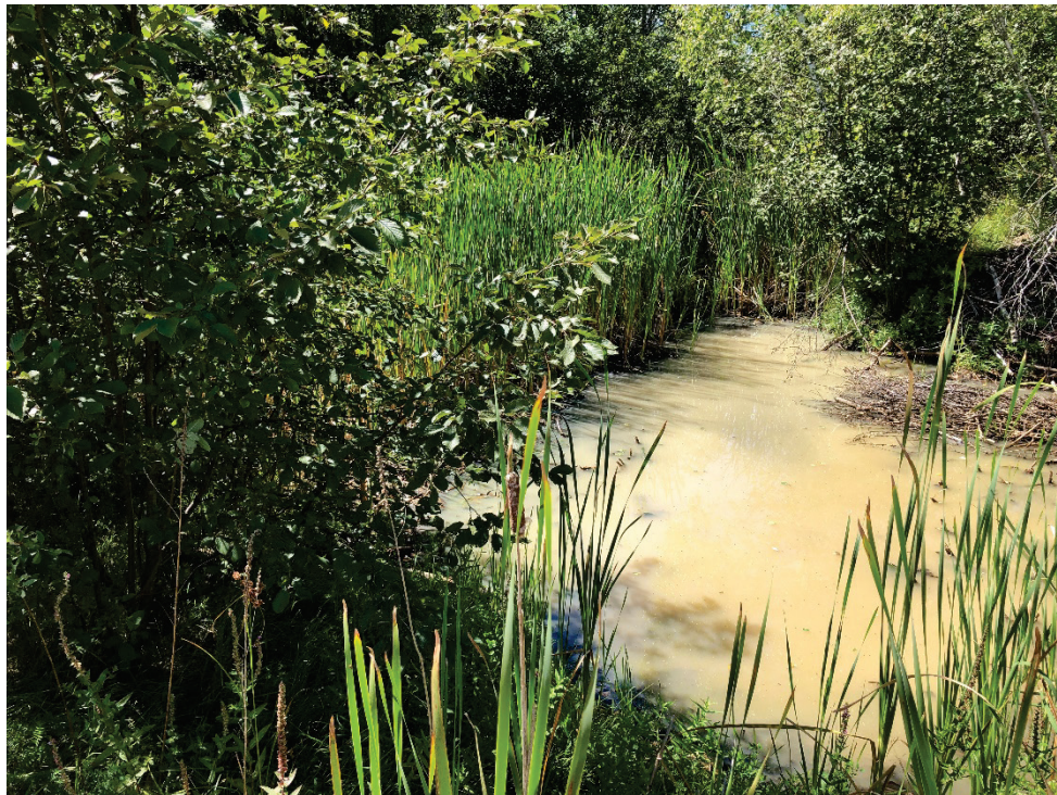
Photo 35 - View of swale ditch entering sedimentation pond on the western edge of the property.