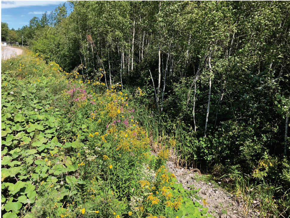
Photo 33 - View of swale ditch on the east side of the property, facing north.