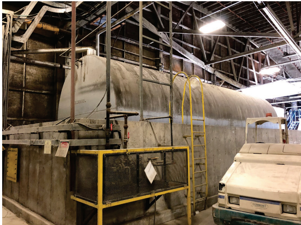
Photo 30 - View of 113,500L Furnace oil tank in north warehouse.