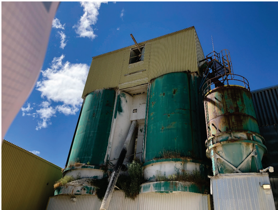
Photo 10 - Photo of stucco storage tanks, looking southwest.