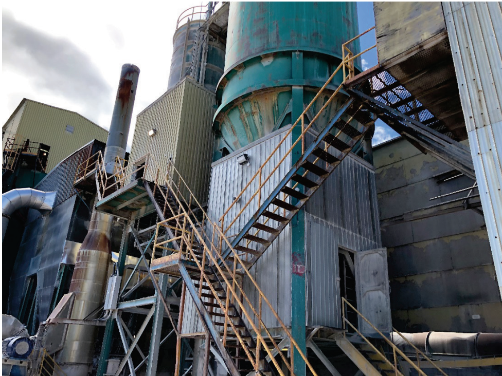
Photo 8 - View of calcine baghouse, looking southwest.