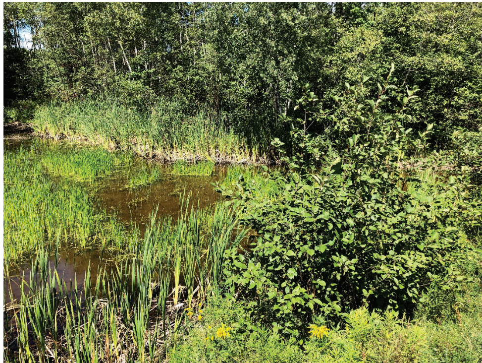
Photo 36 - View of sedimentation pond on the west side of the property.