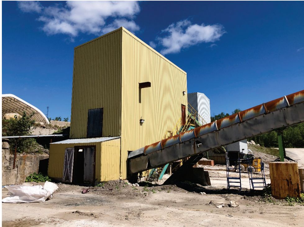
Photo 7 - View of Rock crusher, looking northeast.