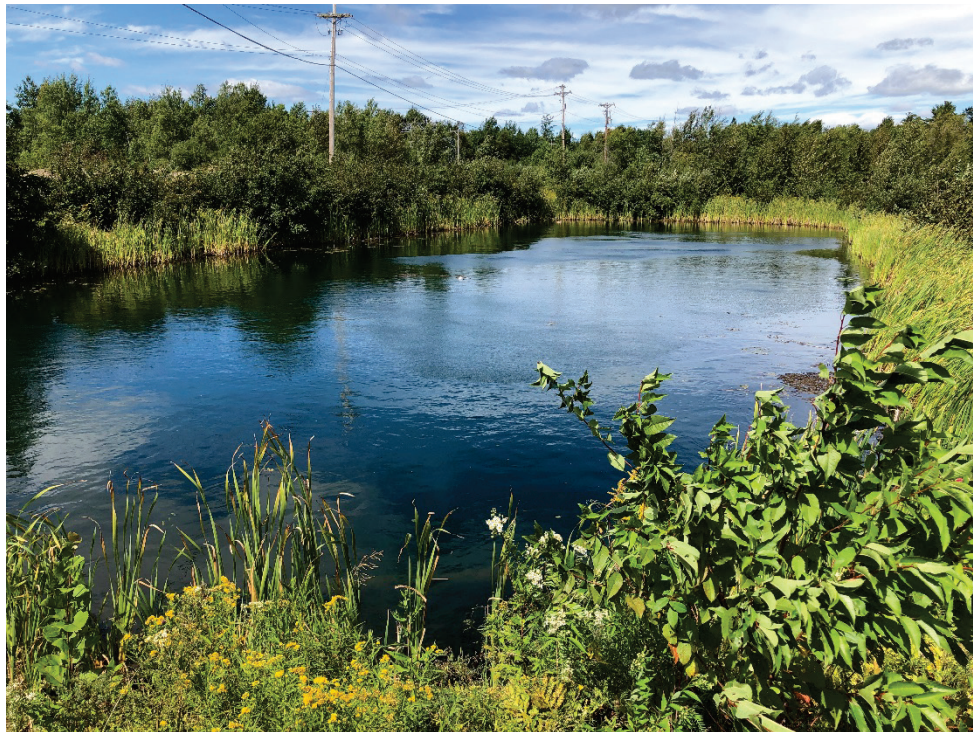
Photo 43 - View of one of two fireponds on site.