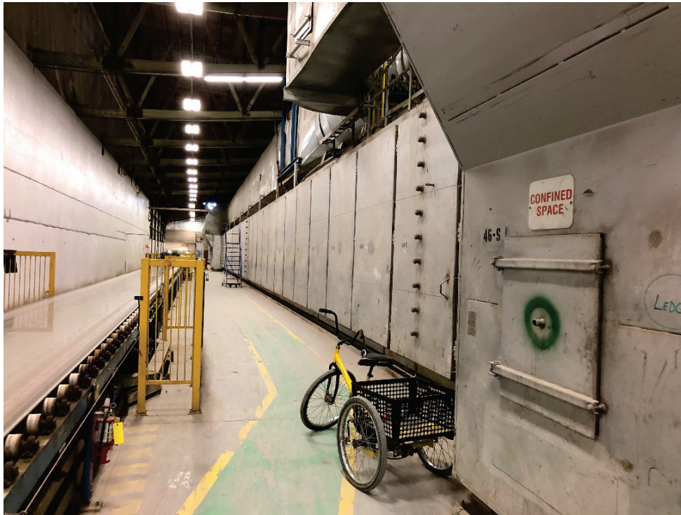
Photo 15 - Photo of accelerator rolls #1 on the left and dryer zone #2 on the right.