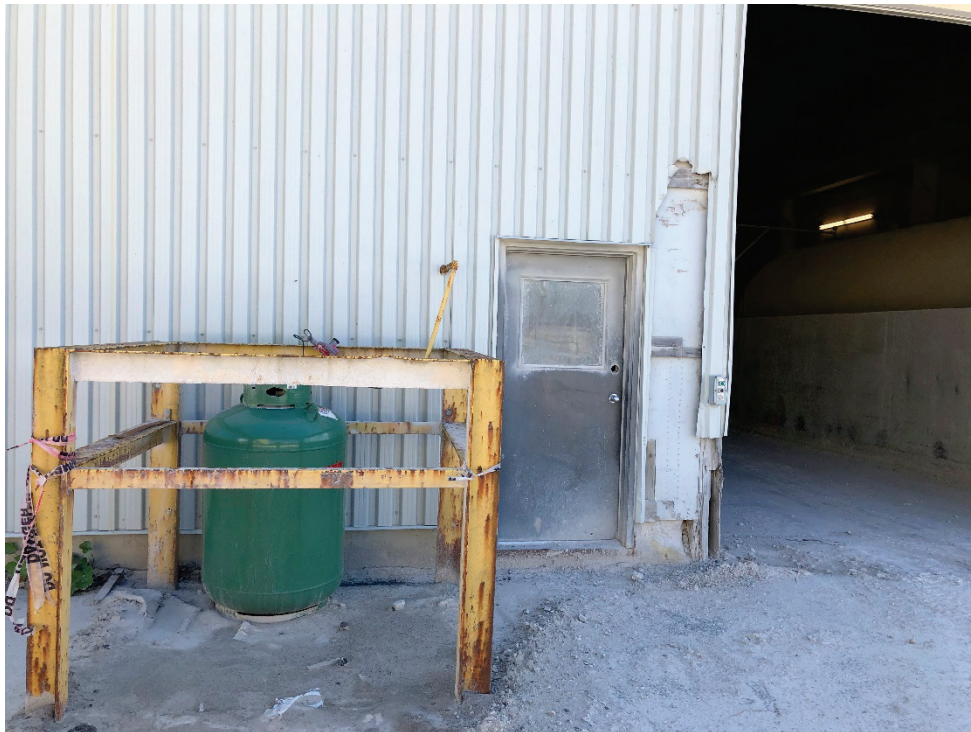
Photo 32 - View of propane storage tank outside rock dryer to the north.