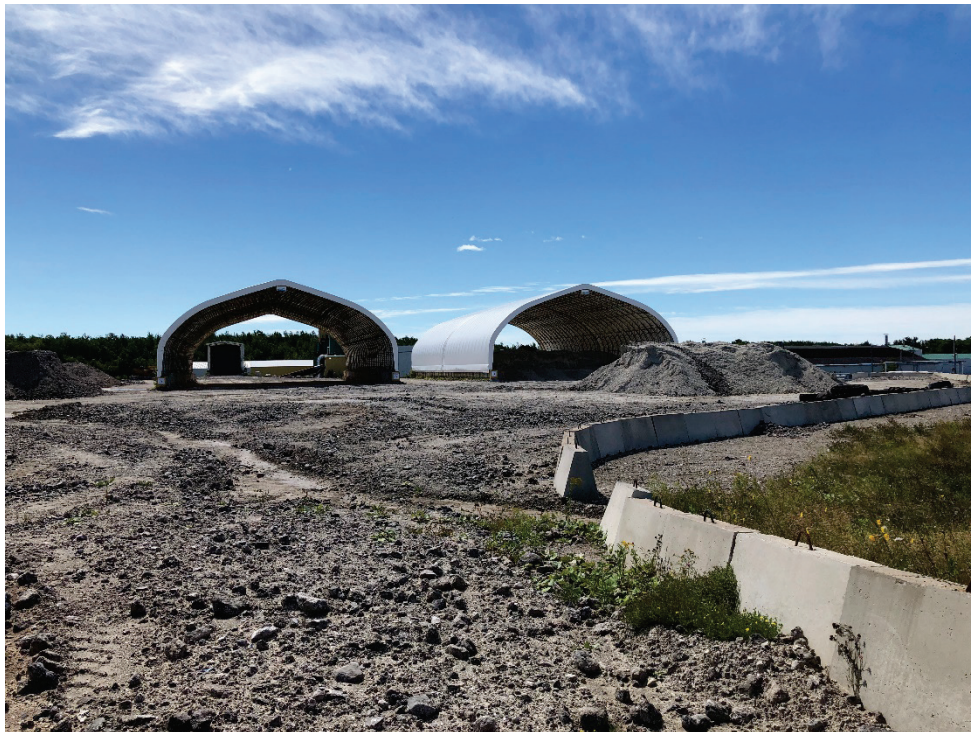
Photo 6 - View facing south of rock storage area.