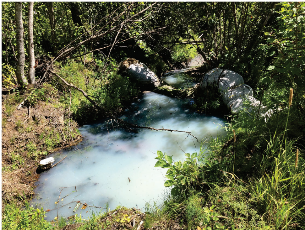
Photo 38 - View of water exiting the sedimentation pond. Siltation device in disrepair.