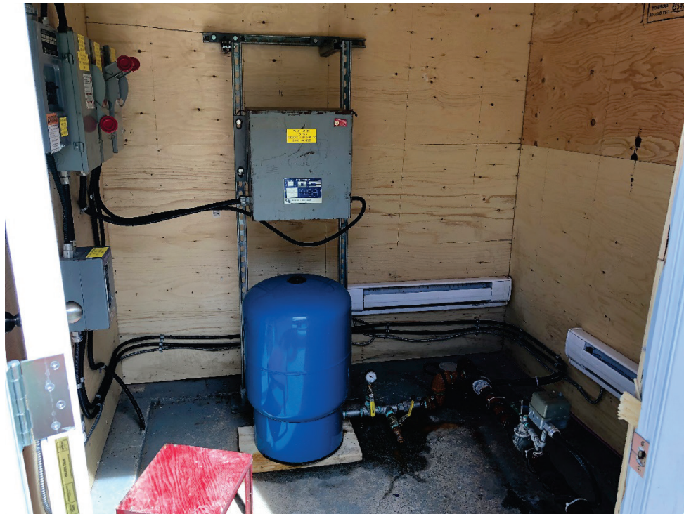
Photo 40 - View of one of the onsite well houses.