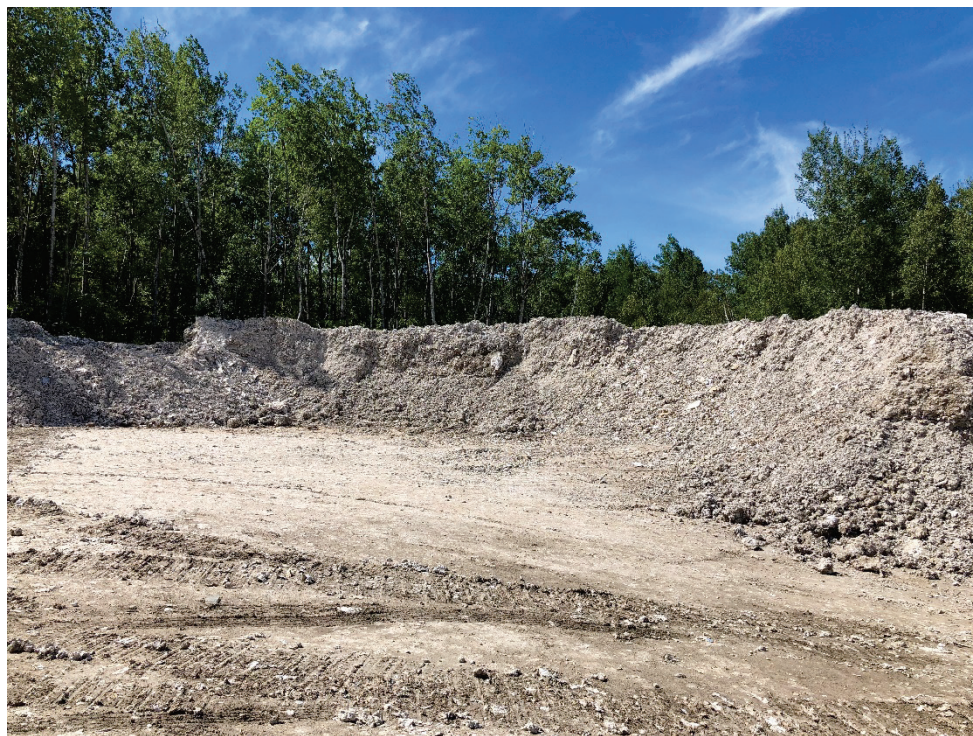
Photo 26 - View of waste paper pile. Facing south.