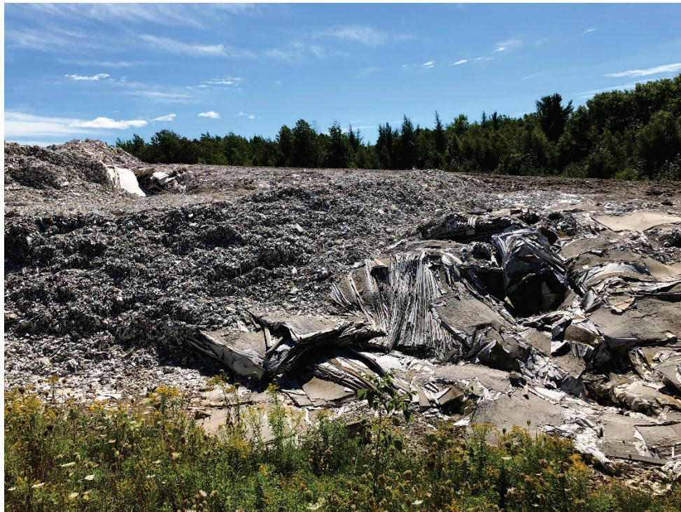
Photo 25 - View of waste wallboard pile, facing southeast.