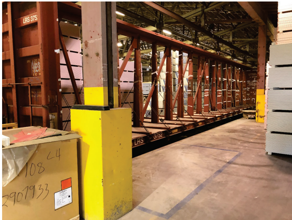
Photo 20 - View of rail loading portion of north warehouse.