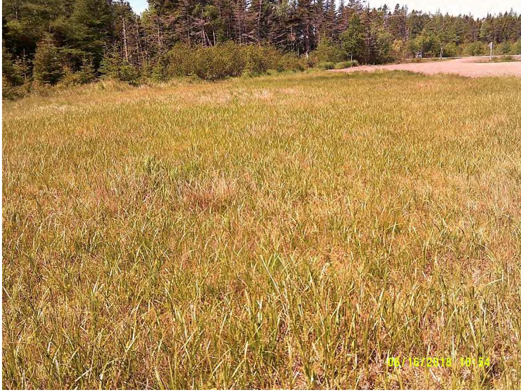
Habitat Photo 3