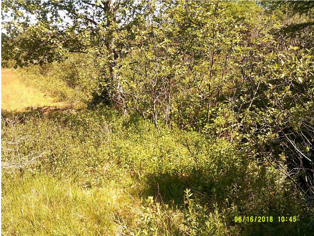
Habitat Photo 6