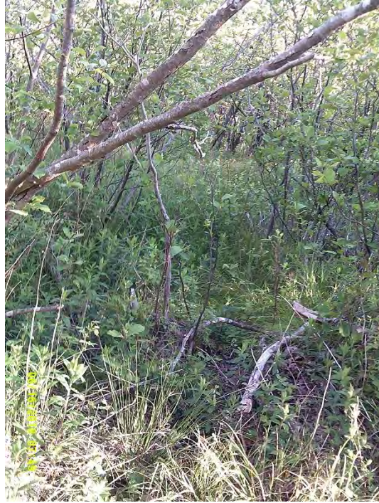
Habitat Photo 2