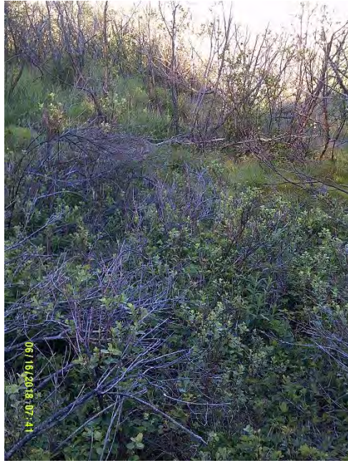
Habitat Photo 5