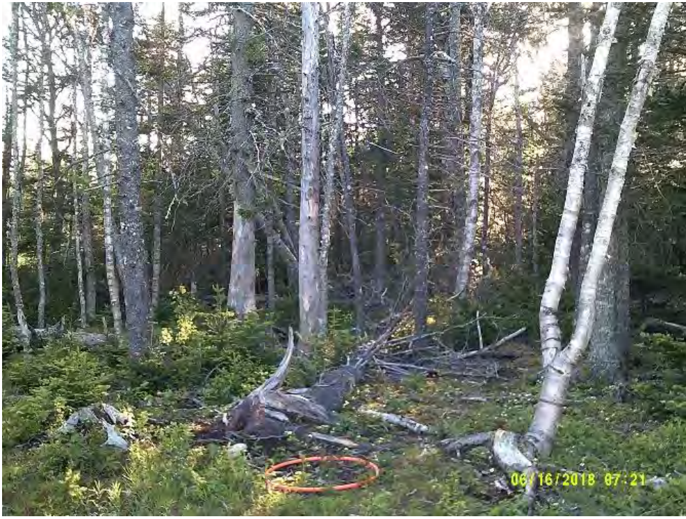
Habitat Photo 7