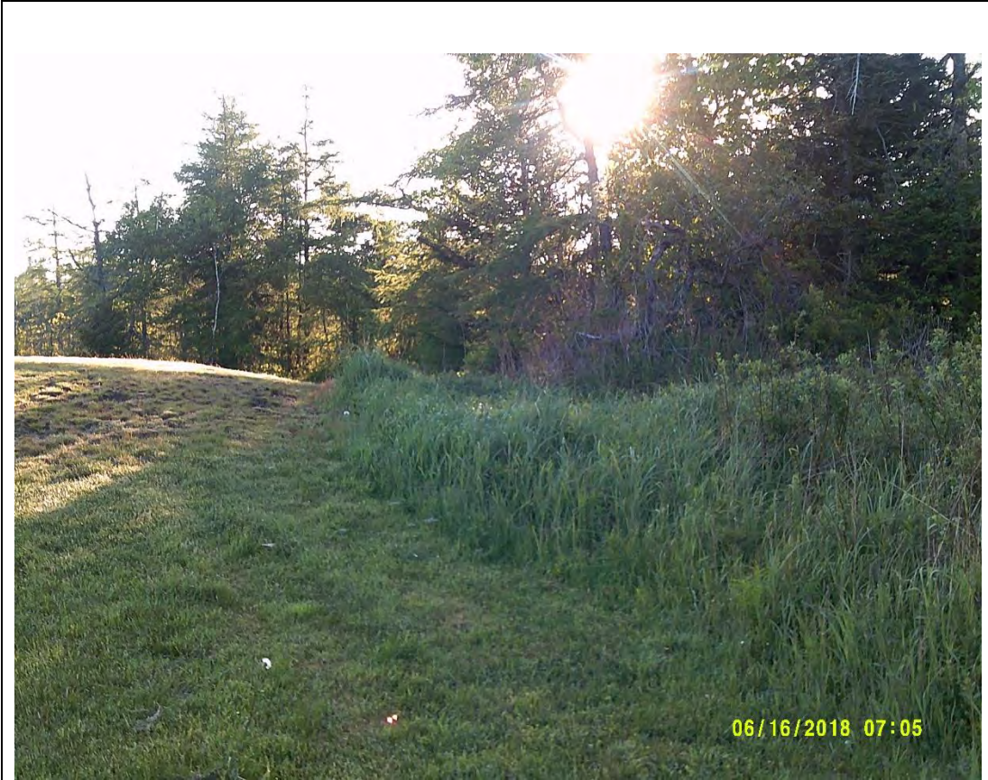
Habitat Photo 4