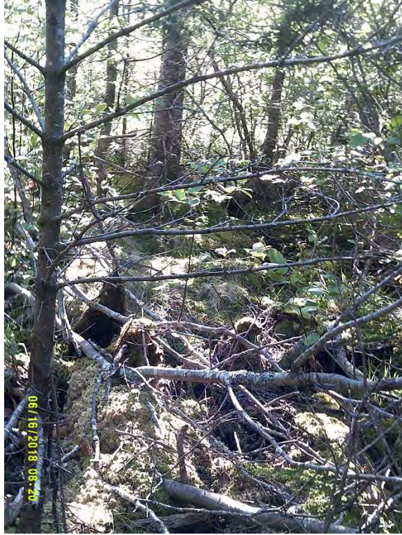
Habitat Photo 1