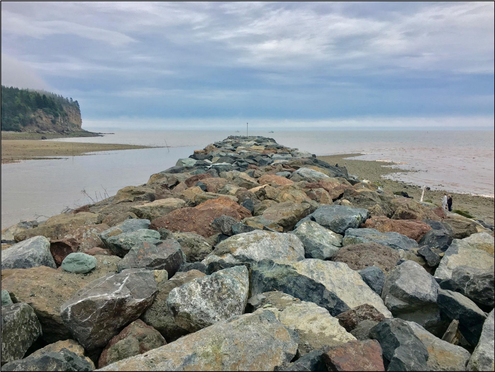
Figure 3: South Breakwater at Alma DFO-SCH, Albert County, New Brunswick