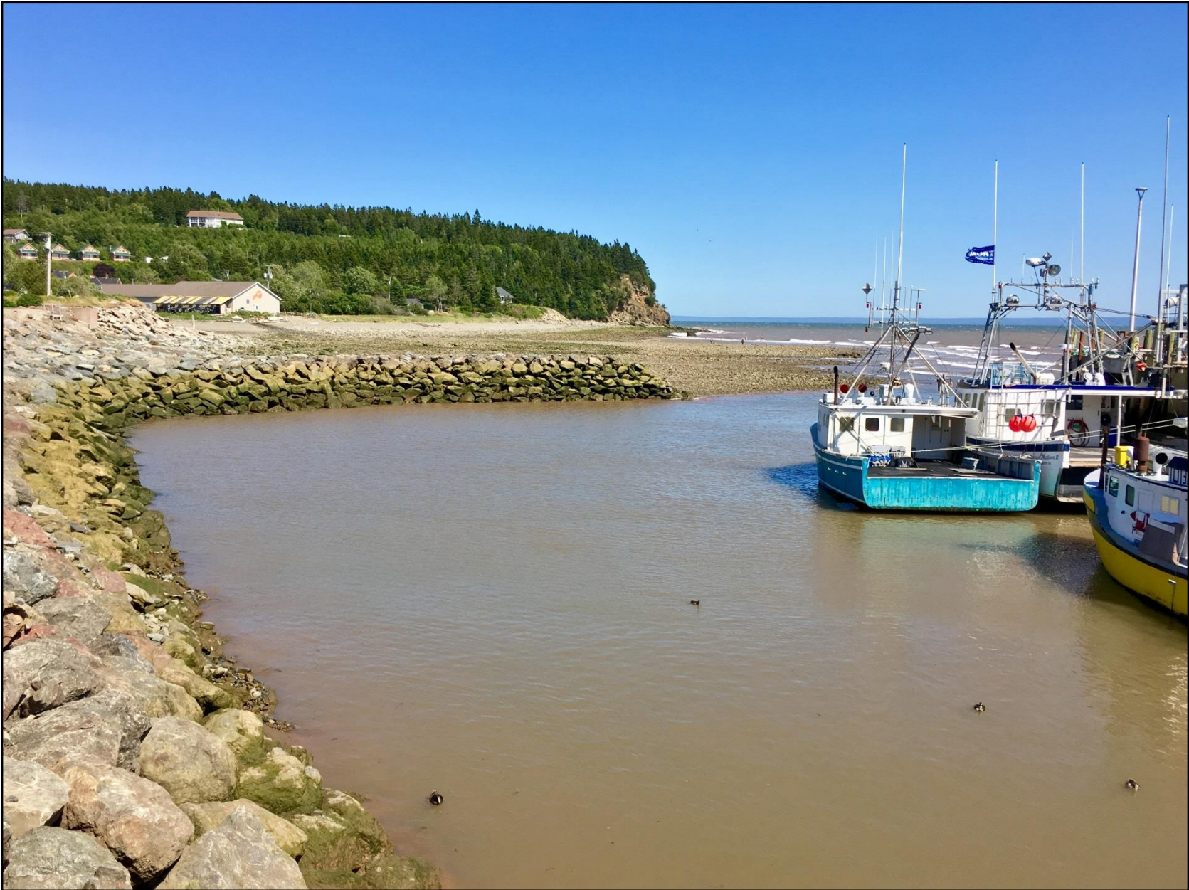
Figure 5: East Breakwater at Alma DFO-SCH, Albert County, New Brunswick