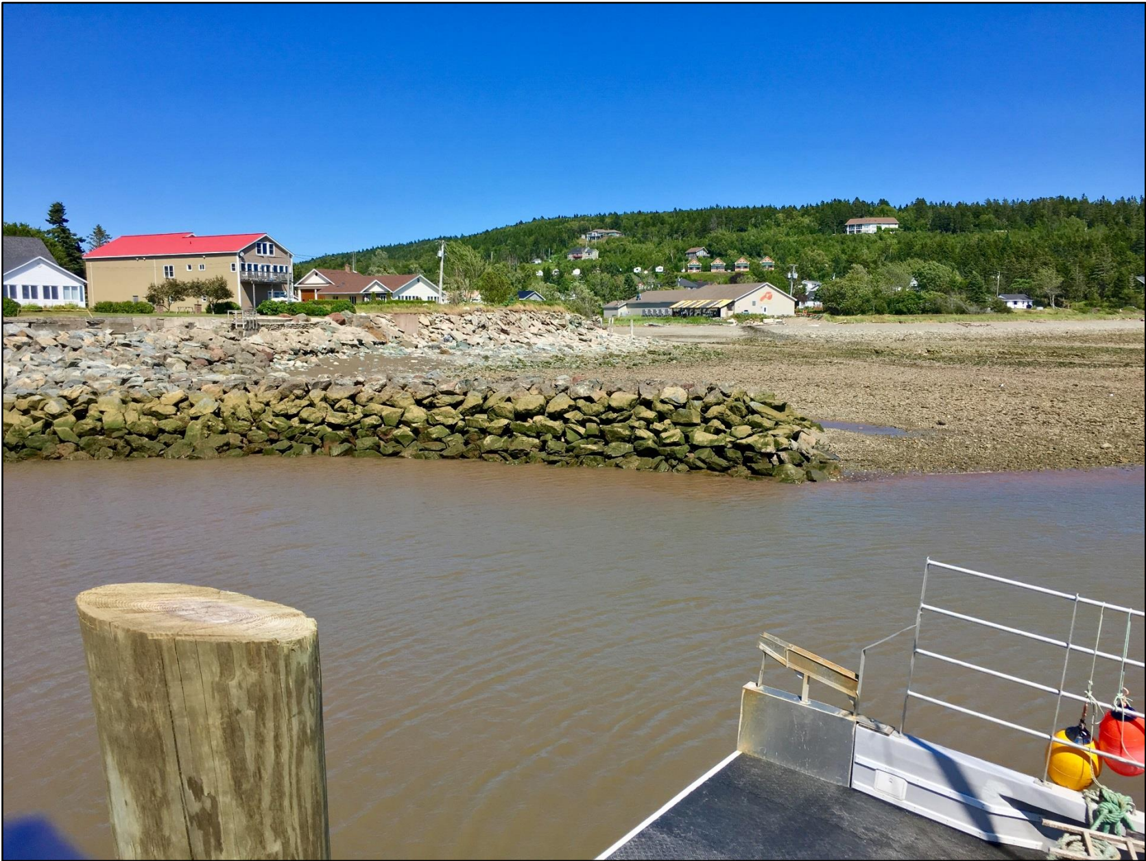
Figure 4: East Breakwater at Alma DFO-SCH, Albert County, New Brunswick