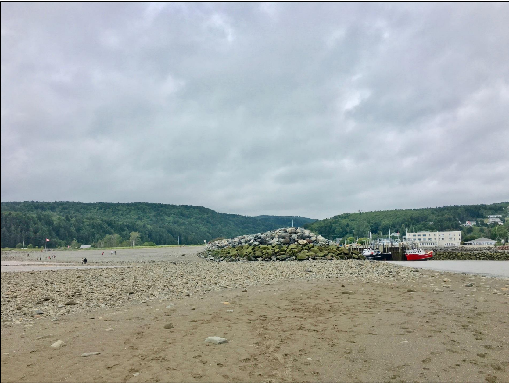
Figure 2: South Breakwater at Alma DFO-SCH, Albert County, New Brunswick