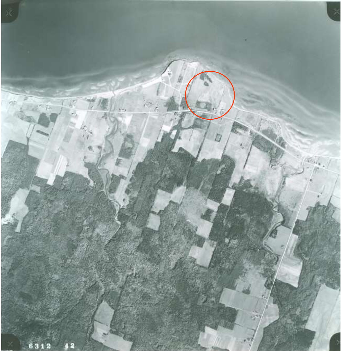
Aerial Photo No. 1: 1963 DNR aerial photo 1963-6312-042 (subject site indicated by red circle)