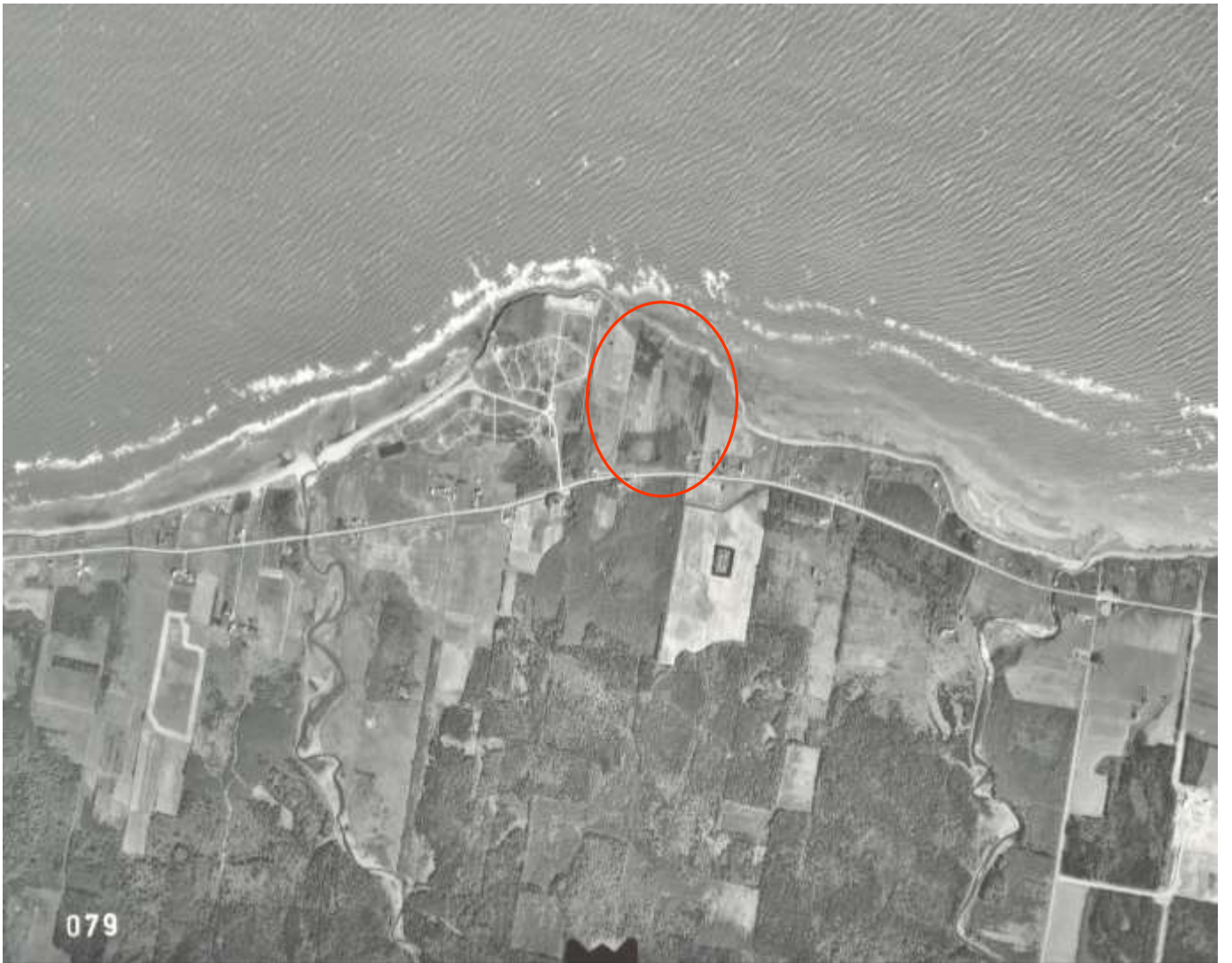
Aerial Photo No. 2: 1976 DNR aerial photo 1976-0511-079