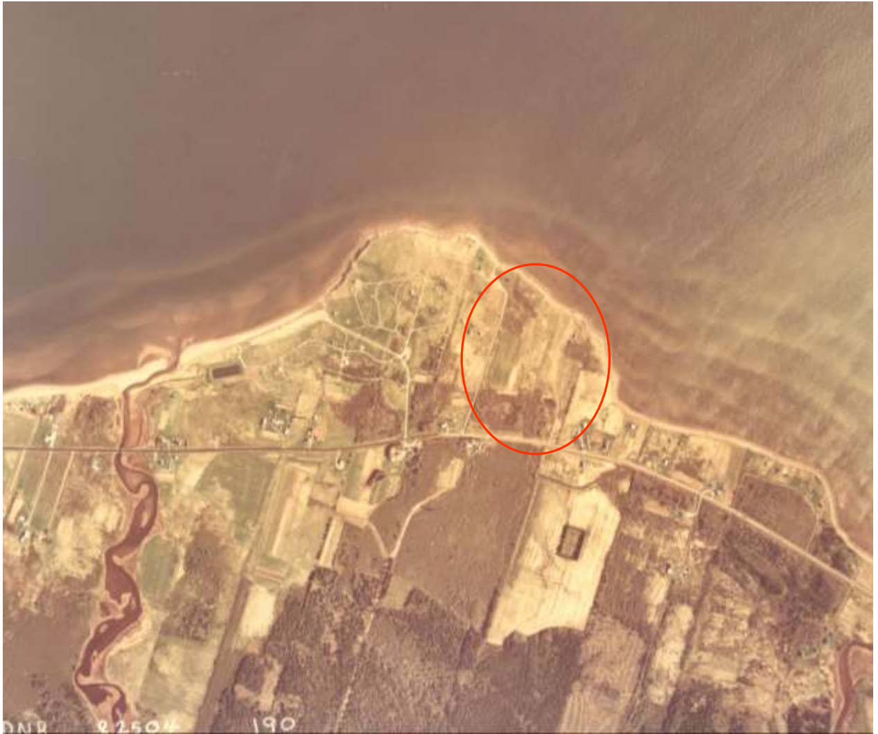
Aerial Photo No. 3: 1982 DNR aerial photo 1982-0504-190