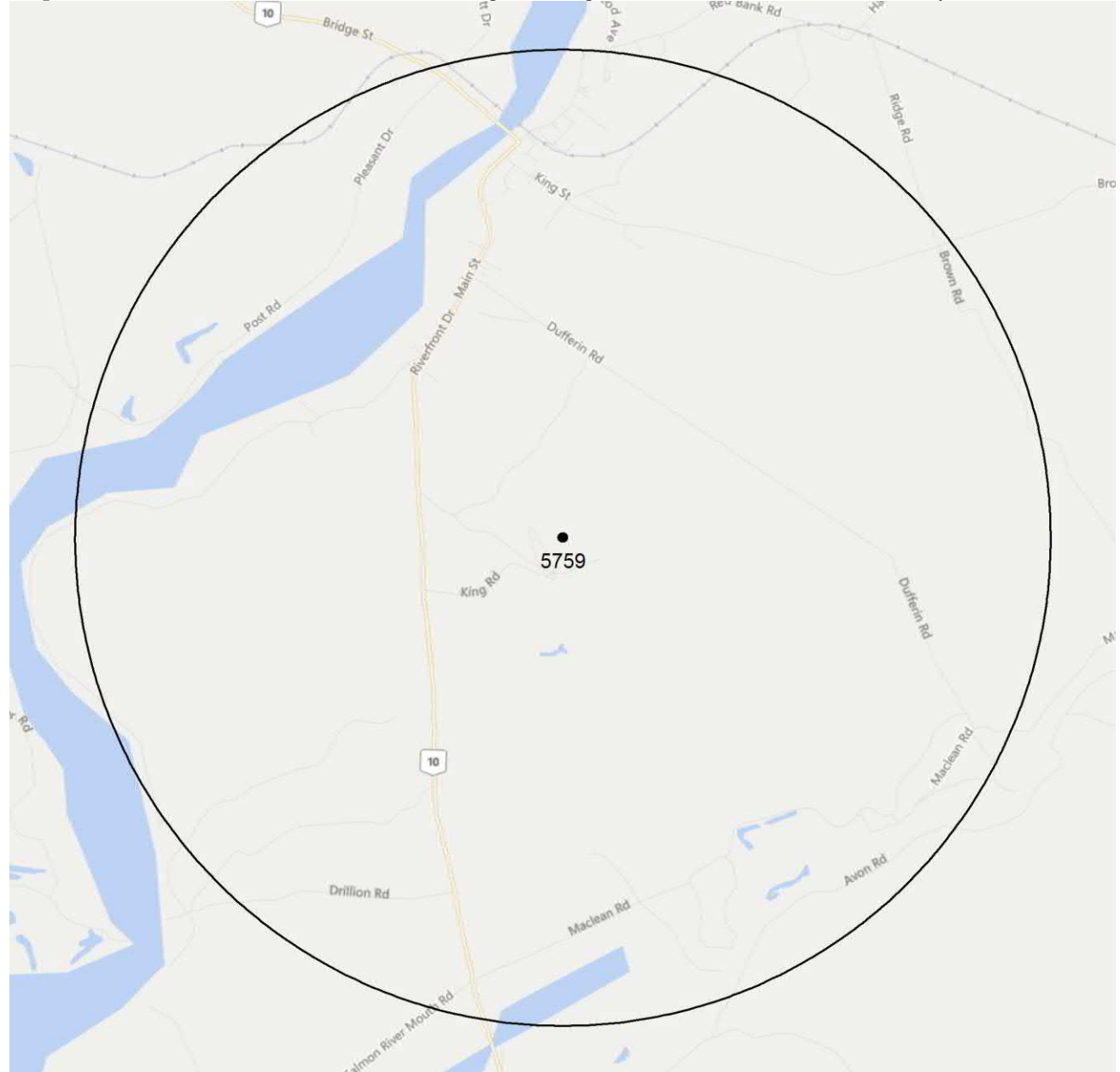
Map 3: Boundaries and/or locations of known Managed and Significant Areas within 5 km of the study area.

The GIS scan identified no biologically significant sites in the vicinity of the study area (Map 3)