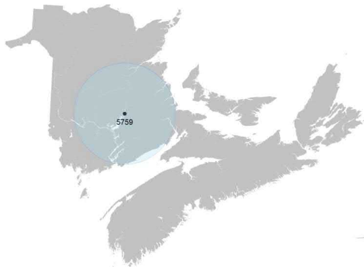
Map 1. A 100 km buffer around the study area