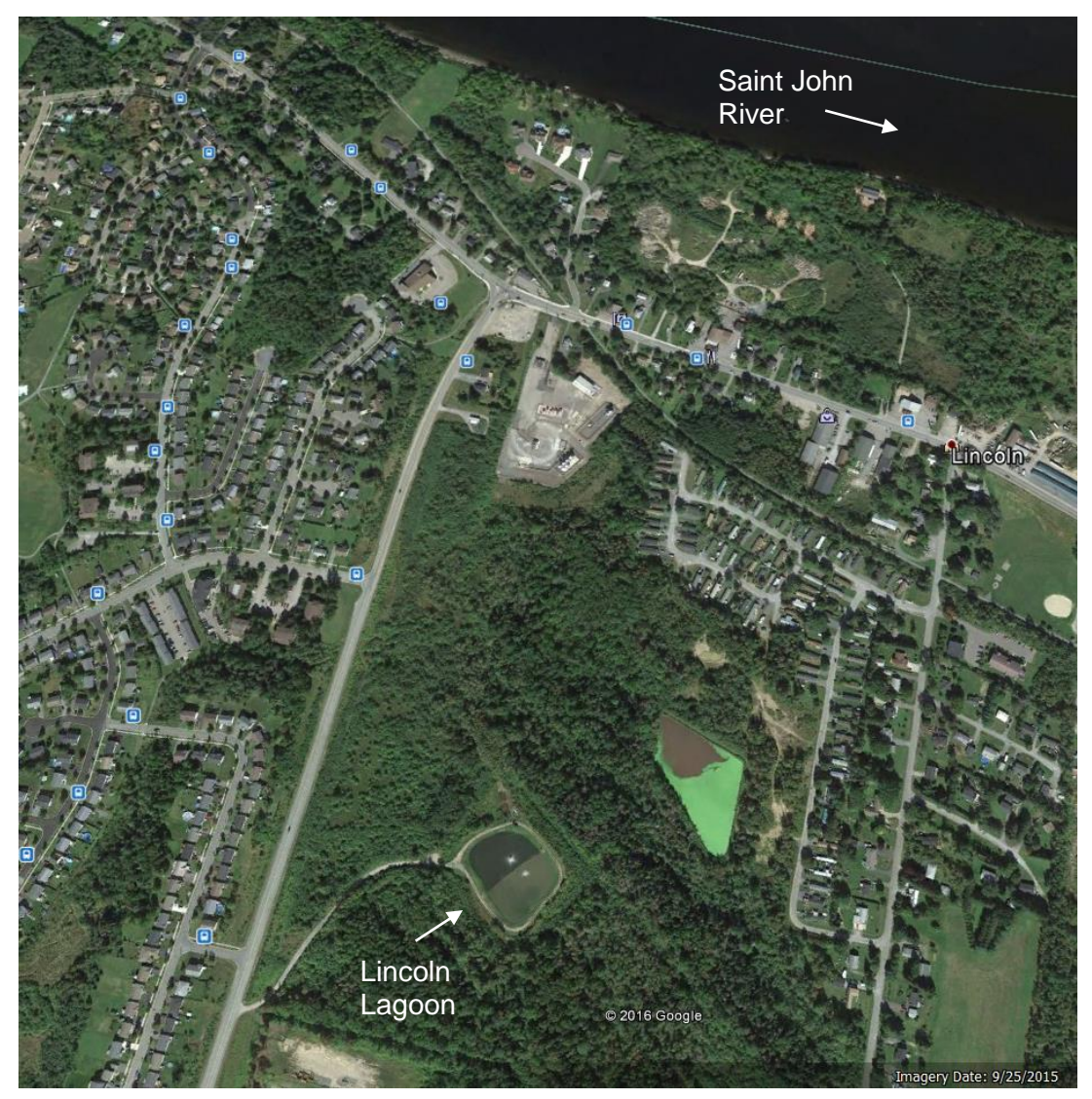
Figure 4 – Site Aerial Map

The property generally slopes down towards the Saint John River. In fact, the surface elevation at the lagoon is approximately 50 ft above sea level and only approximately 20 ft above sea level on the river bank.