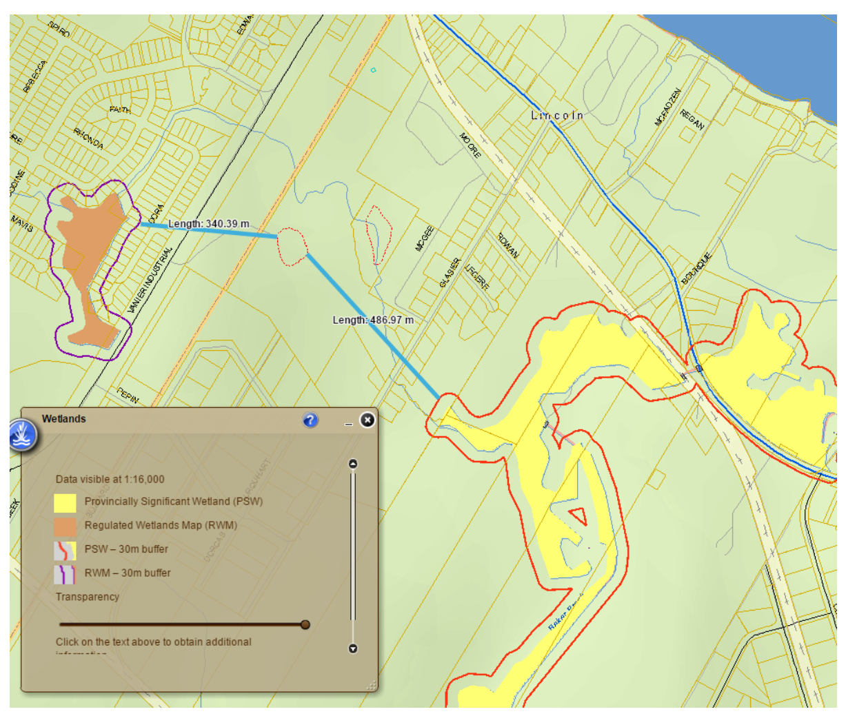
Figure 5 – Wetlands in Proximity

From GeoNB, there are no Provincially Significant Wetlands and Regulated Wetlands located in the vicinity of the project. There are two Wetlands located in the area (refer to Figure 5 below from GeoNB Online Map Viewer), however, both of these Wetlands are located more than 30 m from the Lincoln Lagoon. In fact, both wetlands are over 300 m from the lagoon.