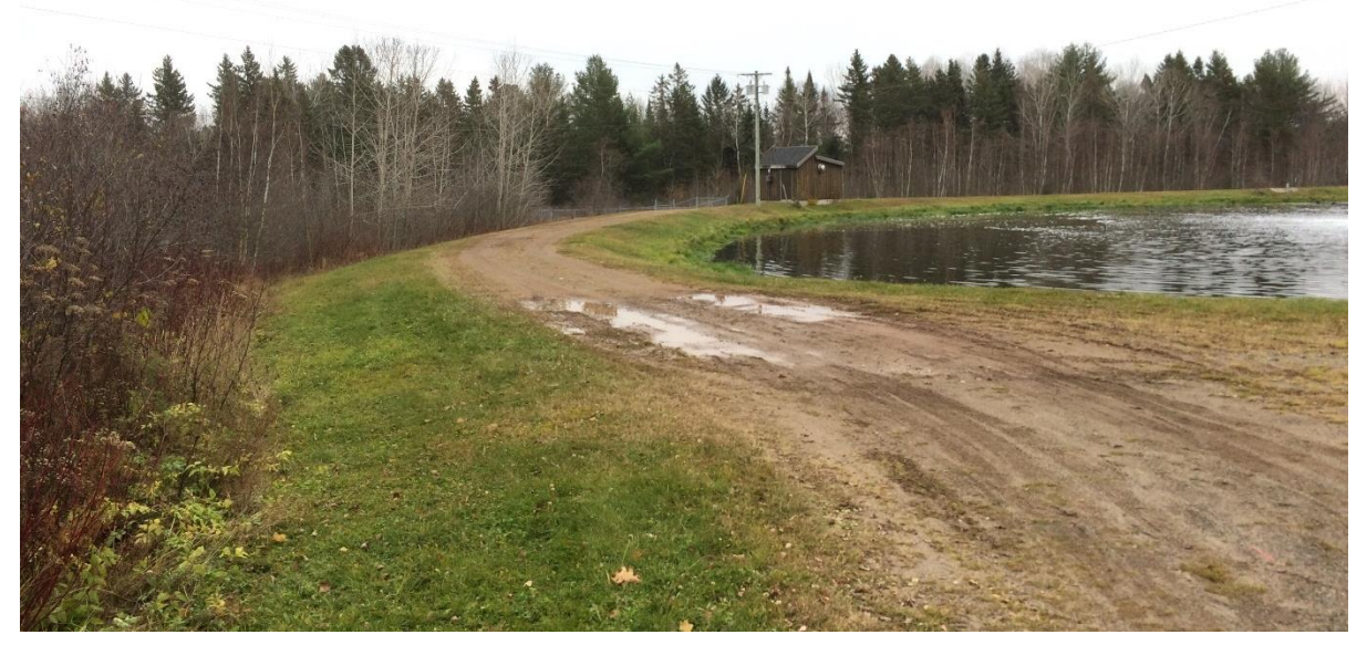
Figure 6 - Lincoln Lagoon Vegetation

The vegetation is, for the most part, a typical central New Brunswick Acadian Forest. Spruce, fir, maple, poplar, white and yellow birch are some of the most common trees in this forest makeup. The photo below was taken by the Lincoln Lagoon during Fall 2016. Wildlife within the area would be typical of rural New Brunswick, such as white-tailed deer.