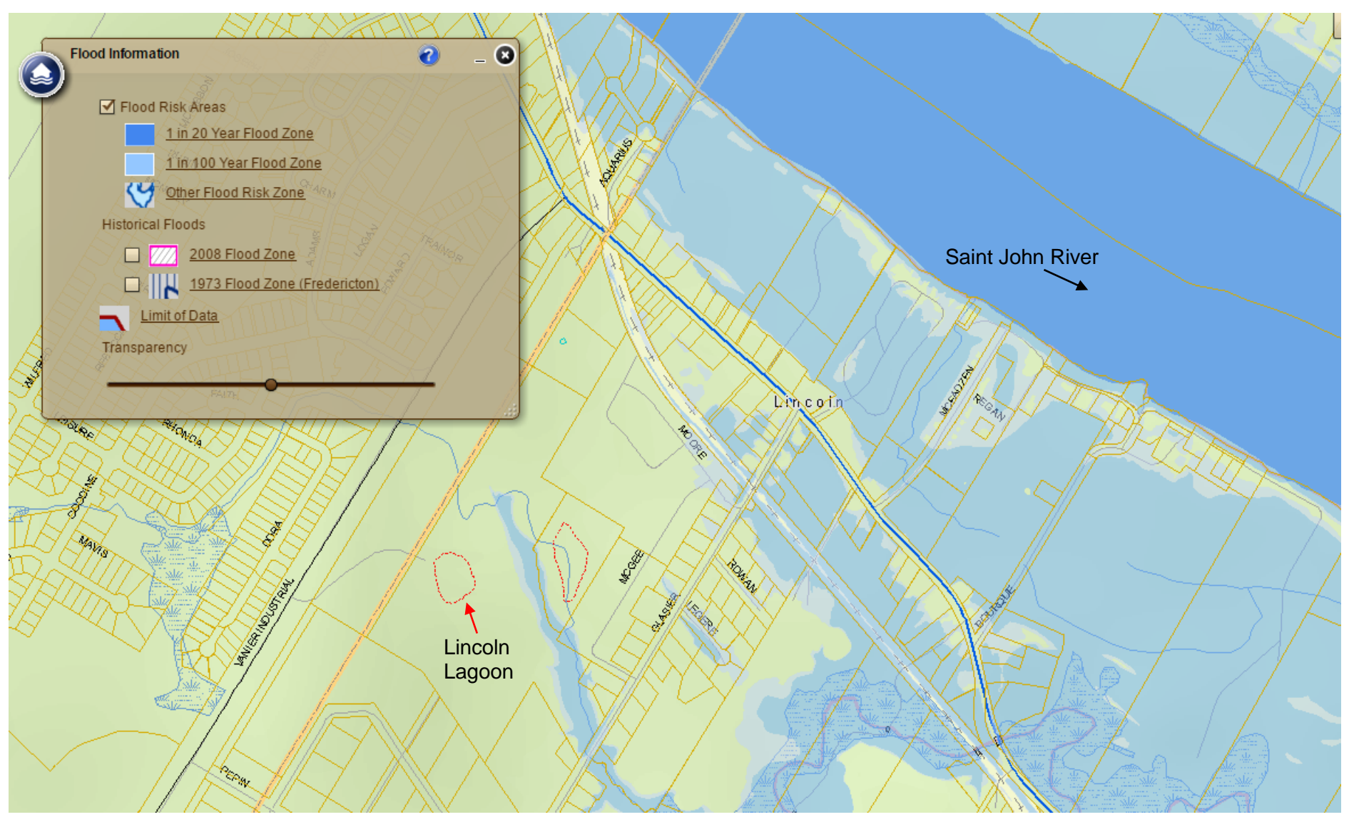
Figure 2 – Flood Risk Areas