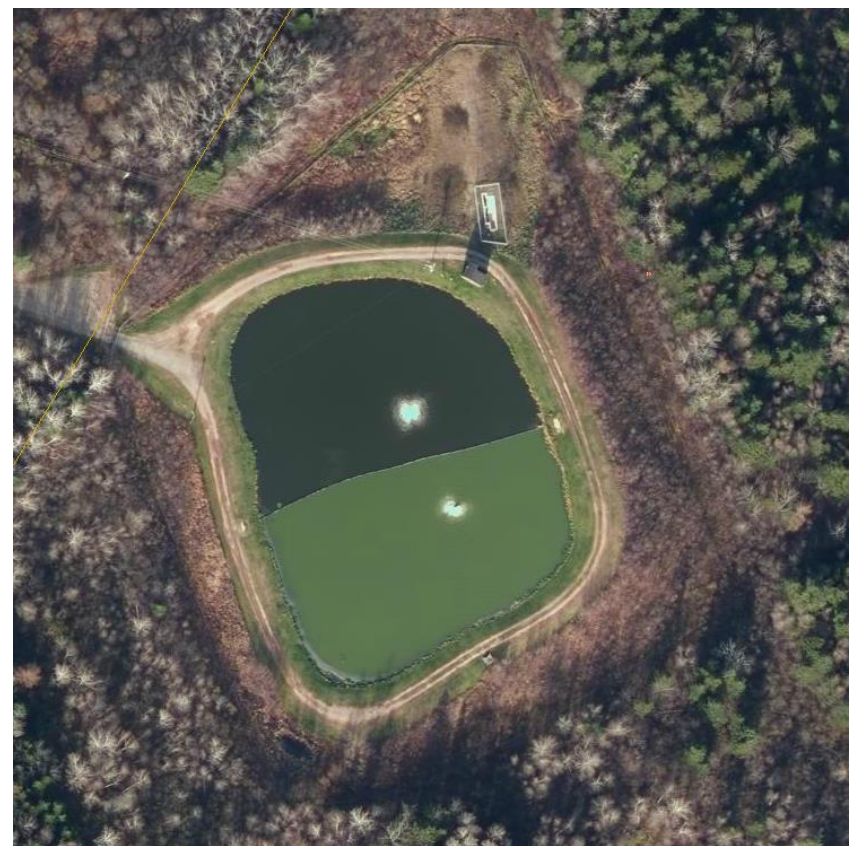
Figure 3 - Site Layout

The Lincoln Lagoon is irregularly shaped as can be seen in Figure 3 below. The following dimensions were approximated with GeoNB. The Lagoon covers an area of approximately 5,650 m<sup>2</sup> (1.4 acres), and has a perimeter of 280 m. Note that the Lagoon itself has a volume of 21,900 m<sup>3</sup>. The total work area for the Lagoon Decommissioning would cover an approximate area of 19,000 m<sup>2</sup> (4.7 acres), with an approximate perimeter of 525 m. This work area includes space for removing the berm as well as the security fencing.