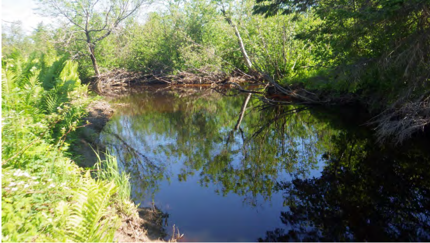
Habitat in ROW.