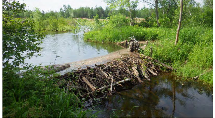
View of beaver dam at outlet of Borrow Pit Pond.