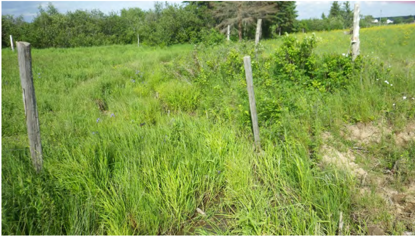
Drainage channel upstream of farm lane culvert.