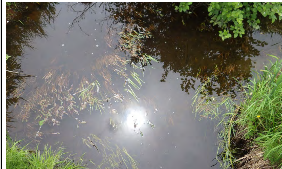
View of aquatic vegetation in ROW.