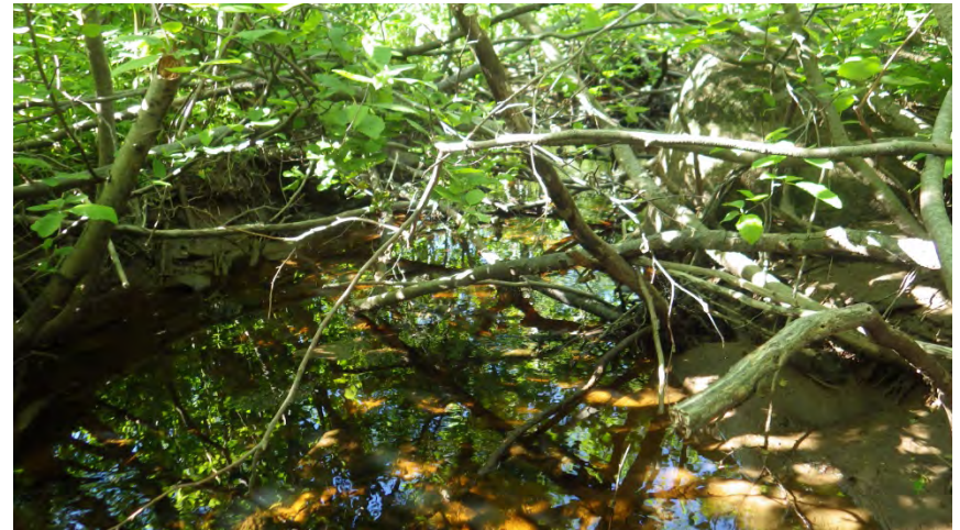
Bank habitat and smaller substrate.

Route 11 – Glenwood to Miramichi Bypass WC 6 (34+945)