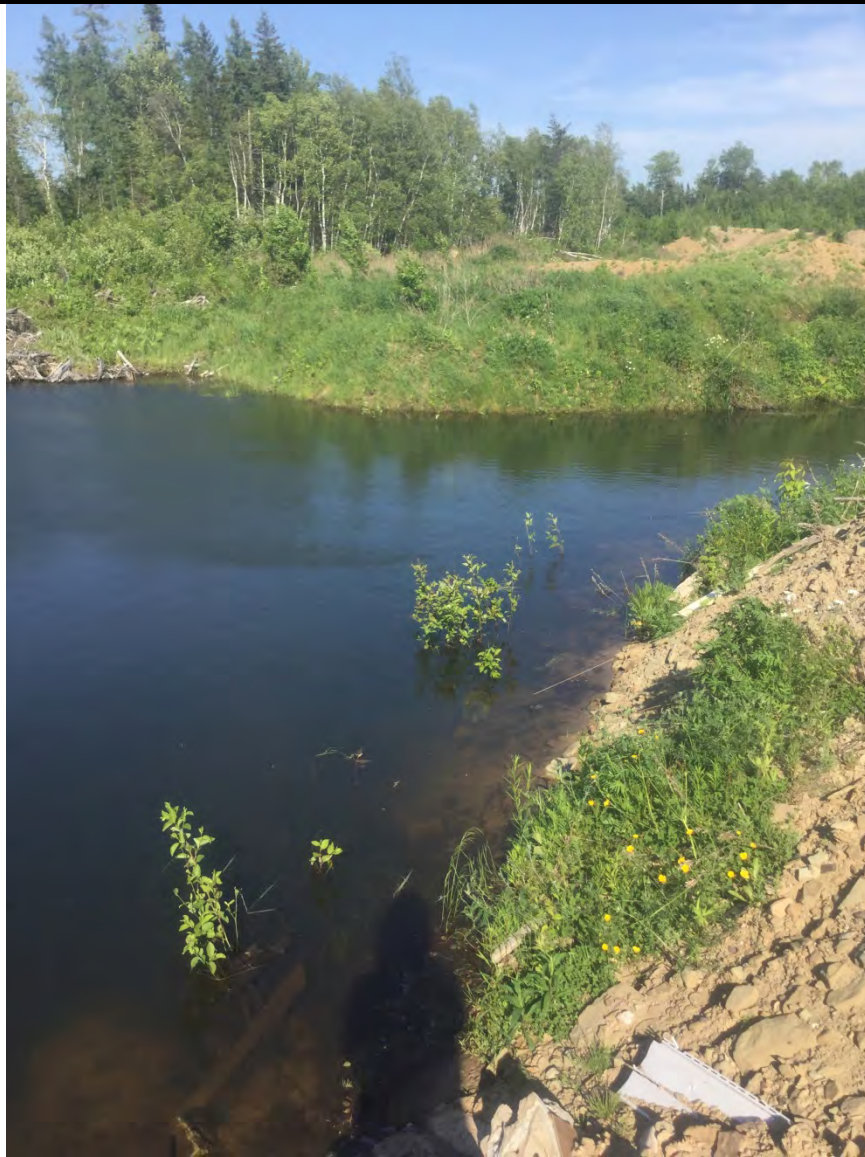
Western extent of Bprrow Pit Pond facing north