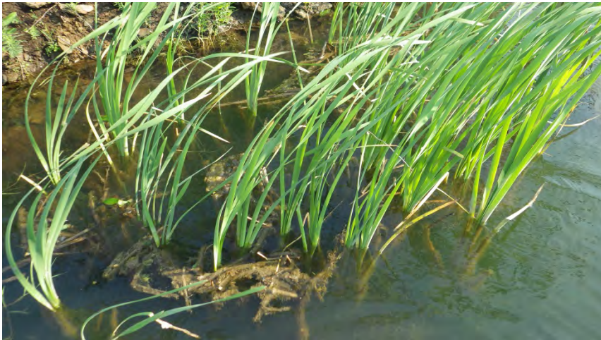
Vegetation in Borrow Pit Pond Drainage channel