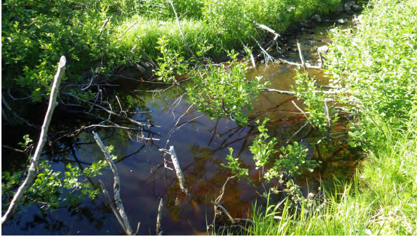
Habitat in ROW.