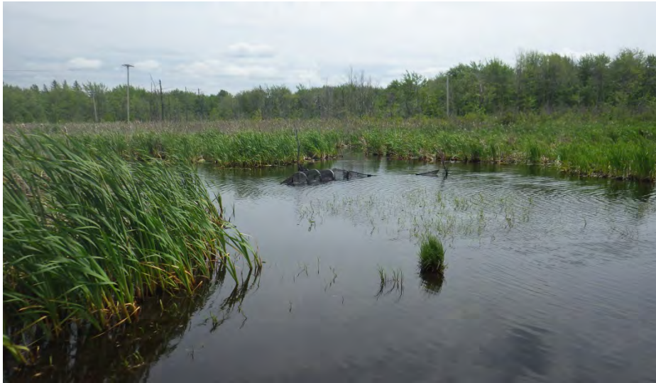
View towards east from within open water marsh