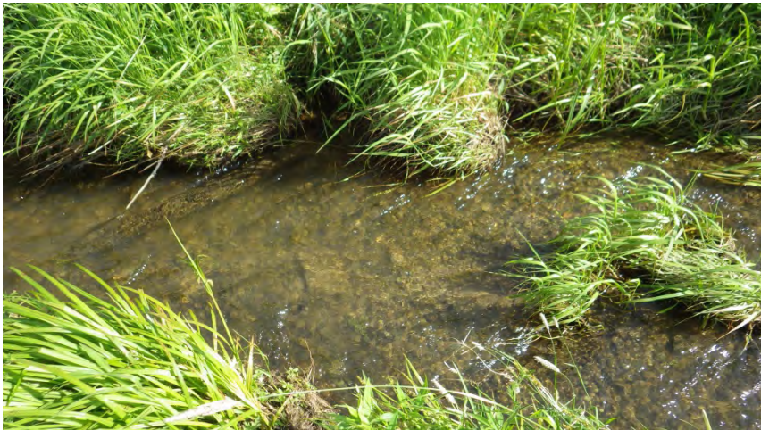
Substrate and bank habitat