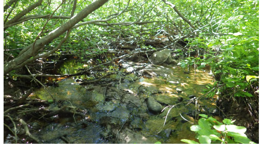
Typical habitat upstream and downstream of ROW.