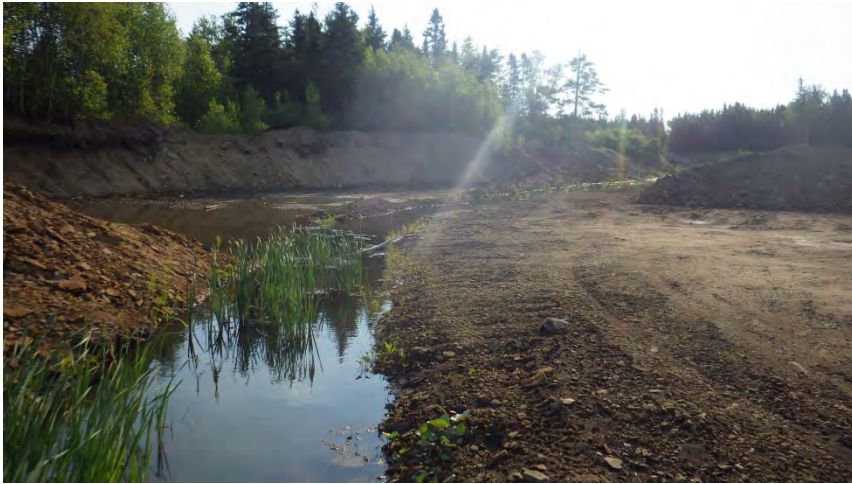
Drainage Channel to Borrow Pit Pond, facing upstream.