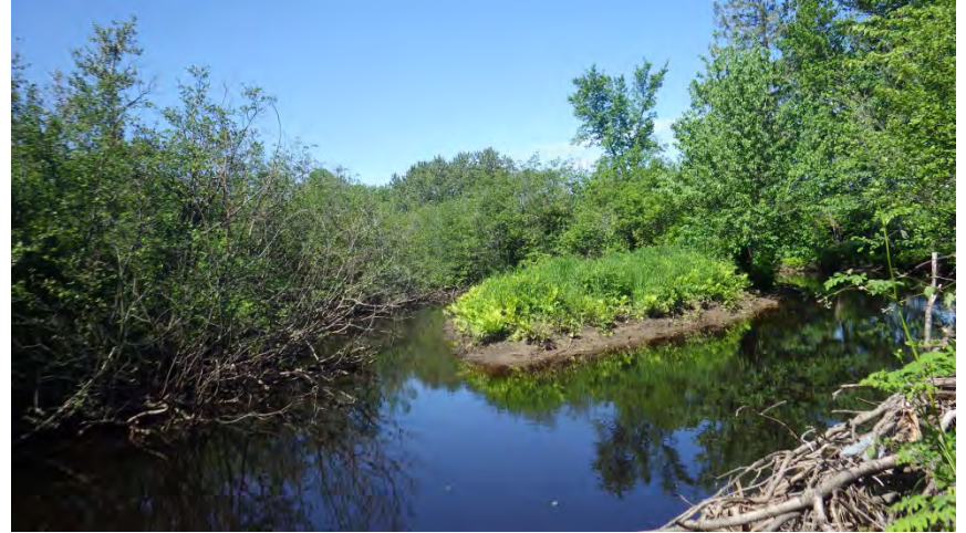
Habitat in upstream extent of ROW.