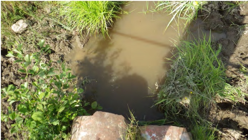
Farm culvert inlet.