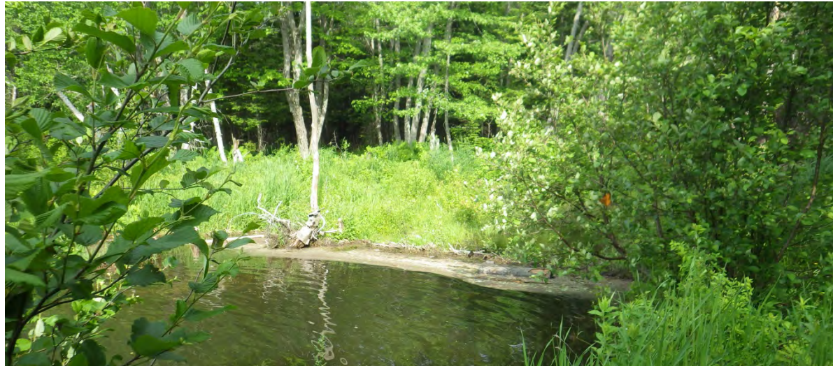
Undisturbed nearshore habitat in Borrow Pit Pond.

Route 11 – Glenwood to Miramichi Bypass WC 2 A (70+675)