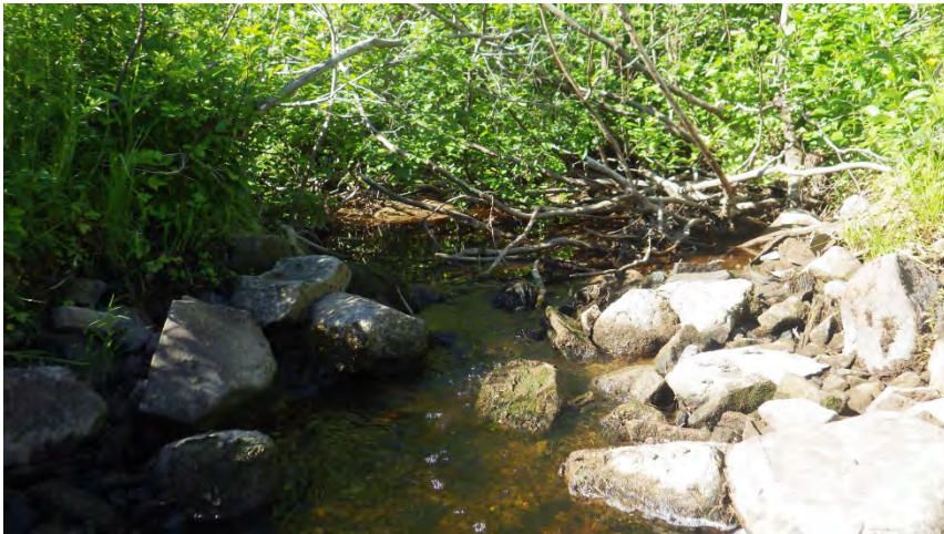
Bank habitat and large substrate.