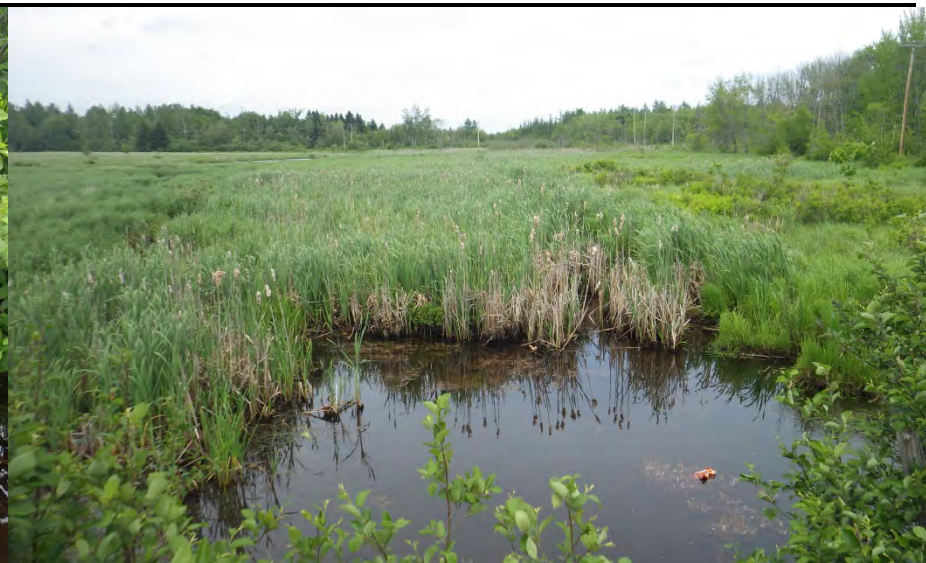
Habitat downstream of King Street.