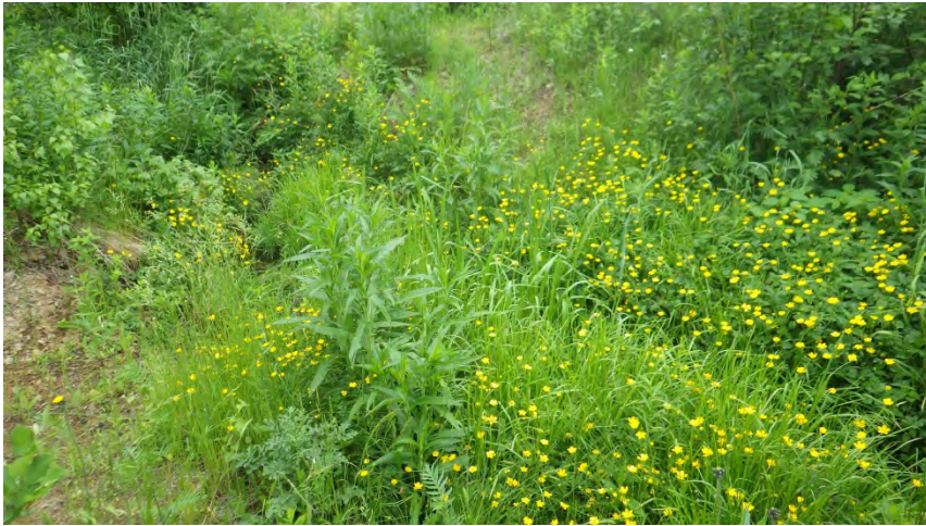
Habitat in downstream extent.