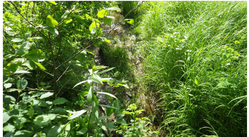
Channel immedietly dowstream of culvert.

Route 11 – Glenwood to Miramichi Bypass WC 3 (33+810)