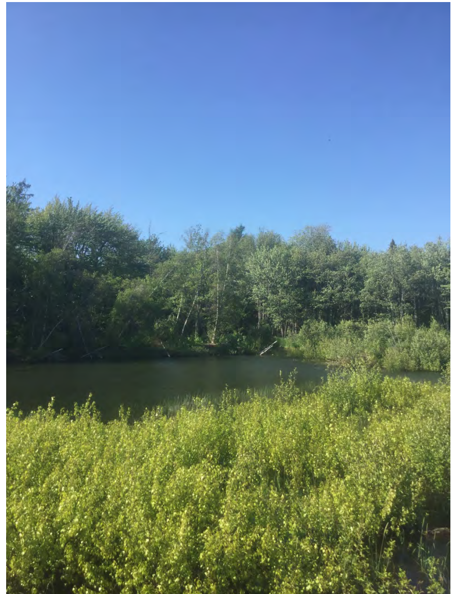
Western extent of Borrow Pit Pond facing west.

Route 11 – Glenwood to Miramichi Bypass WC 2 (31+575, 300+400)