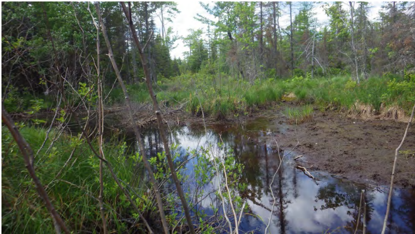
Substrate and exposed banks.