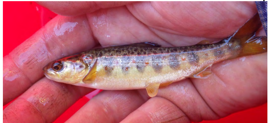
One of two age classes of salmon parr sampled.

Route 11 – Glenwood to Miramichi Bypass WC 5 (34+540) Napan River