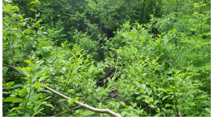
Typical upland vegetation in area of watercourse.