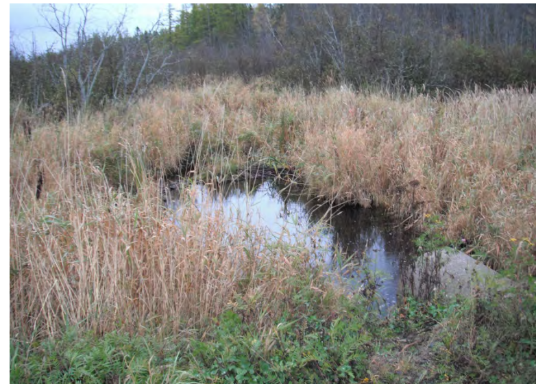
Habitat immediately downstream of trauk culvert outlet.

Route 11 – Glenwood to Miramichi Bypass WC 1A (400+415, 300+650, 70+255)