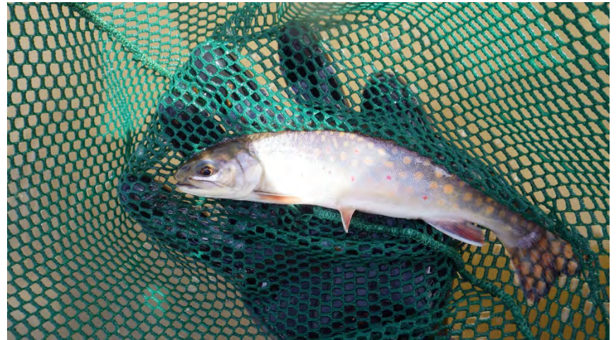
One of several brook trout sampled in watercourse.

Route 11 – Glenwood to Miramichi Bypass WC 4 (34+225)