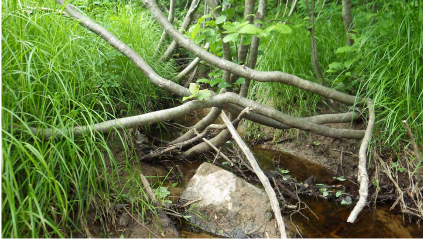
Habitat in ROW.