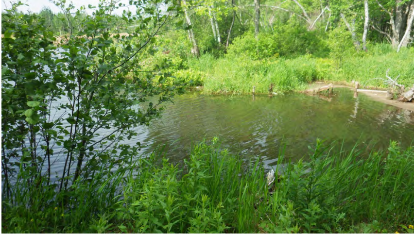
View of Borrow Pit in outlet area