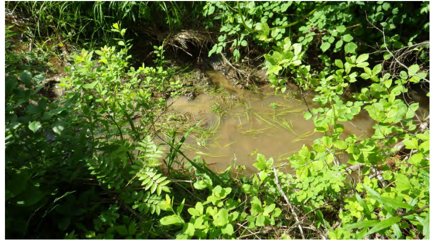
Channel downstream of farm culverte and in downstream extent of ROW.