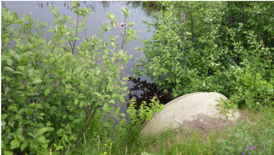
View of trail culvert inlet at downstream extent of marsh.