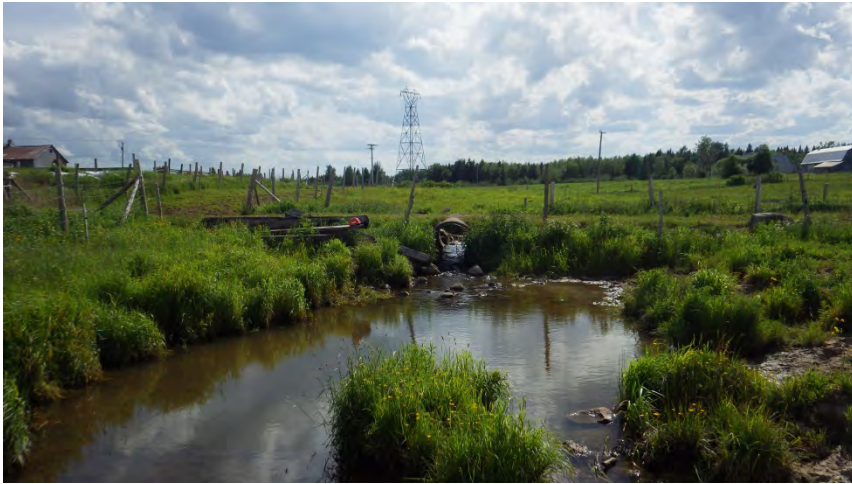
Habitat in area of farm lane culvert.