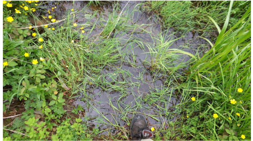
Habitat within ROW.