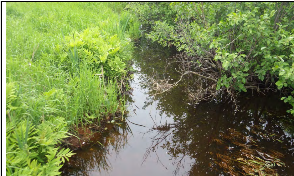
Upstream view of King Street