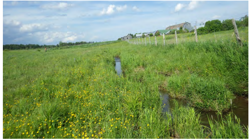
Channel downstream of farm culverte and in downstream extent of ROW.