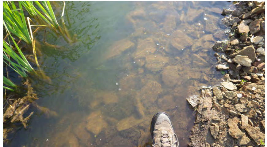
Habitat upstream of Route 11 with beaver dam and ponded area.

Route 11 – Glenwood to Miramichi Bypass WC 2 D (31+700, 300+480, 200+550), 2 E (80+630) and 2 F (31+850, 200+700, 80+840)