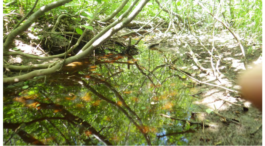
Habitat downstream of beaver pond