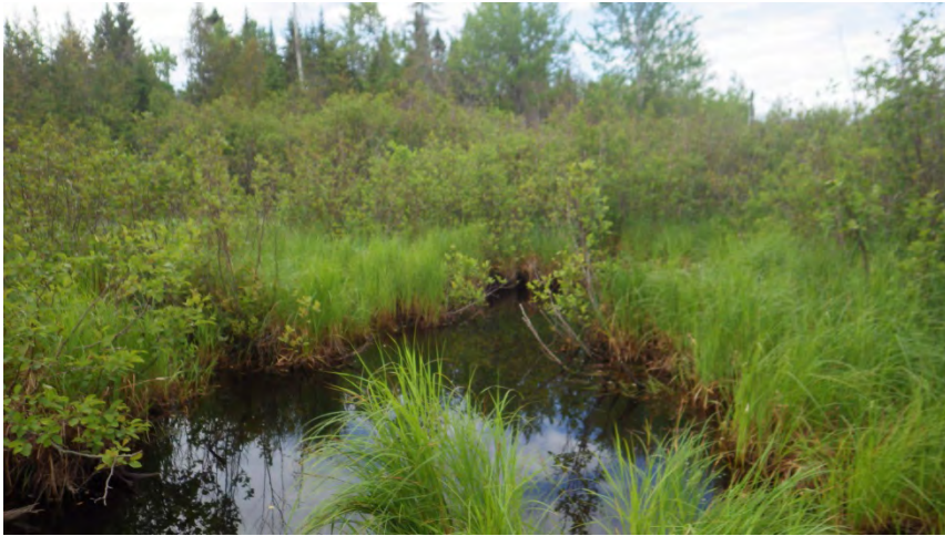
Beaver pond and wetland habitat in ROW.