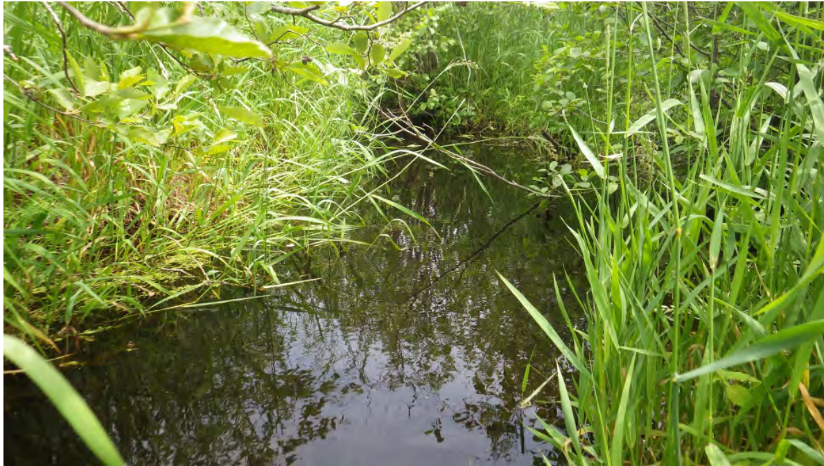
Habitat in excavated channel bottom within the ROW.

Route 11 – Glenwood to Miramichi Bypass WC 2 C (80+525)