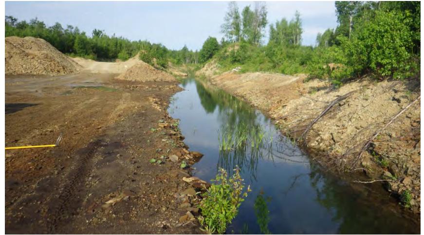
Drainage channel to Borrow Pit Pond, facing downstream.