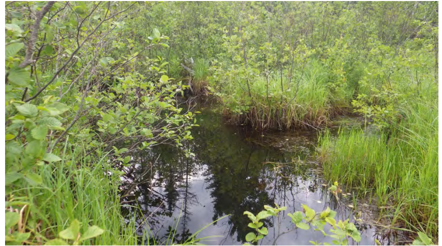
Habitat downstream extent of beaver pond