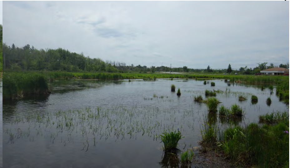
View to west from within open water marsh.