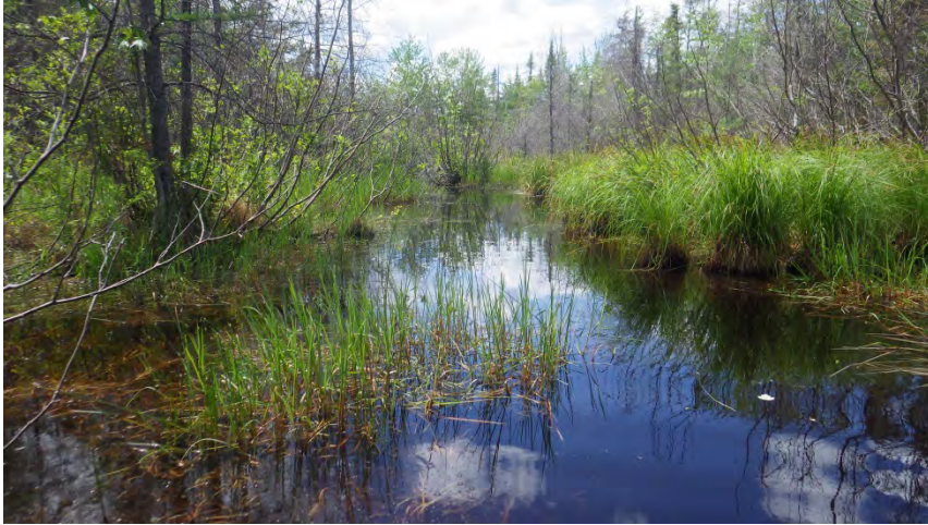
Beaver pond habitat in ROW.