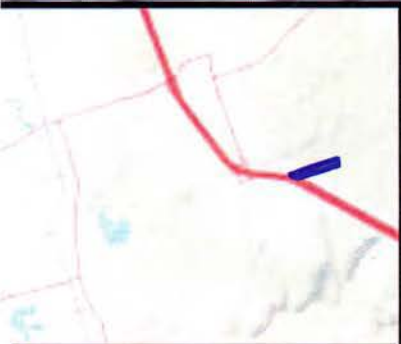
Memramcook Water Supply Index Map