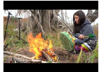
The making of the Wolastoq Song Recording