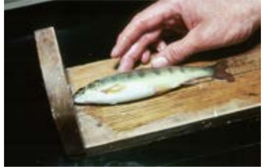
Atlantic salmon smolt

It is estimated that approximately 14 million smolt have been stocked annually from 1999 through to 2004 in Atlantic Canada. If production in the State of Maine is included, stocking for the region peaked in 2002 at an estimated 20 million smolt. Annual farmed salmon production (in tonnes) for Atlantic Canada and corresponding farm gate value is depicted in Fig. 1. Values for the years 2005 through 2007 are estimates given stability in the industry and levels of smolt stocked annually in Atlantic Canada remaining close to 14 million; however production for the year 2007 is reflective of the maximum 12 million smolt available for the region in 2005. An additional bar in green reflects the tonnage that may be expected if only seven million of the available smolt are stocked, and the associated value of that production is shown as an additional point. It is noted that smolt stocking numbers are indicated for the associated harvest year and that actual stocking would have occurred two years prior. It is also noted that, while ordered depopulations due to ISA occurred in all of the years indicated, a significantly larger number, approximately three million fish, were ordered eradicated in the fish that made up the 2004 harvest year, therefore resulting in less fish making it to market.