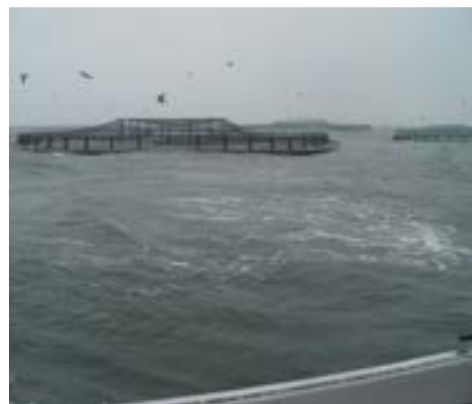
Offshore Atlantic salmon rearing cages

Successful demonstration of this concept could provide additional growth opportunities for the industry in Atlantic Canada, as well as create a market for high technology growing and feeding equipment designed and manufactured in this region. Unfortunately, the increasing gravity of the financial crisis gripping the salmon industry has severely curtailed the capacity of the industry to invest in the development of offshore technology, despite its promise and its potential to improve the profitability of salmon farming in Atlantic Canada.