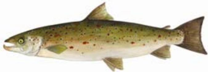
Illustration of Atlantic salmon ( Salmo salar )

Given the importance of the industry to Atlantic Canada, a task force led by the New Brunswick Department of Agriculture, Fisheries and Aquaculture (NB DAFA) and Fisheries and Oceans Canada (DFO) was established in