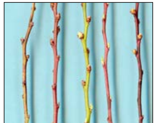
Fig. 3. A wild blueberry stem showing floral buds (large) and leaf buds (narrow)

After the winter dormancy period, the plants begin to grow again. The floral buds begin to swell, and full bloom generally occurs within 3 to 4 weeks. Each floral bud gives rise to a little stem of flowers. There are generally about 5 to 6 flowers in each floral bud. If pollinated, these flowers will give rise to fruit that is harvested in August or early September. For more information on pollination, refer to Factsheet B.1.0 .