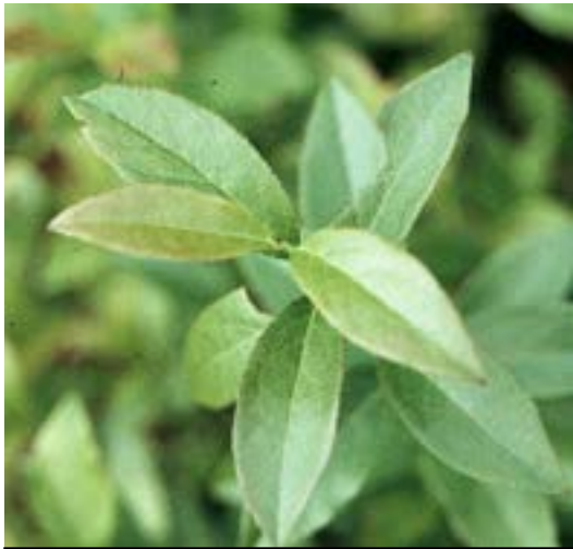
Fig. 2. A wild blueberry stem showing a black tip, when the plant ceases its summer growth

rhizomes develop under the soil surface in the organic matter layer. Roots develop along the length of the rhizomes and can be found primarily within the first few centimeters of soil.