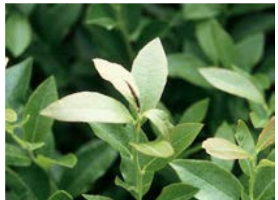
Figure 1. The appropriate stage for sampling wild blueberry leaves (tip dieback).

In wild blueberry production, standards have been established for the vegetative year of the growing cycle when the nutrient levels are most stable. This occurs at the tip die back stage, when the newly emerged stems stop elongating, and the growing tip turns brown to black (Figure 1). In New Brunswick, tip die back will tend to occur during the last two weeks of July, but will depend on when the fields were pruned, the season's weather and the latitude.