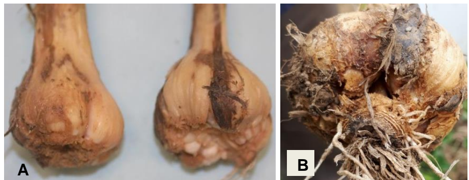
Figure 2 A and B. Garlic bulbs damaged by the stem and bulb nematode. Severely infected garlic bulbs are soft, discoloured and deformed, with a portion of the roots absent.